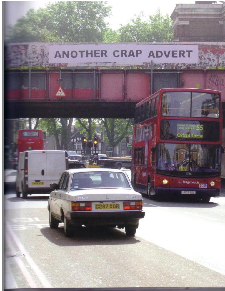
Figure 2. ( Wall and Piece 103)

One of Banksy's more heroic and political endeavors has to be his work at the West Bank segregation wall in Palestine. In Wall and Piece he claims that "Palestine has been occupied by the Israeli army since 1997. In 2002 the Israeli government began building a wall separating the occupied territories from Israel...Palestine is now the world's largest open-air prison and the ultimate activity holiday destination for graffiti artists" (Banksy 110). This wall functions as a perfect spectacle of power and "security". Nations around the world raise