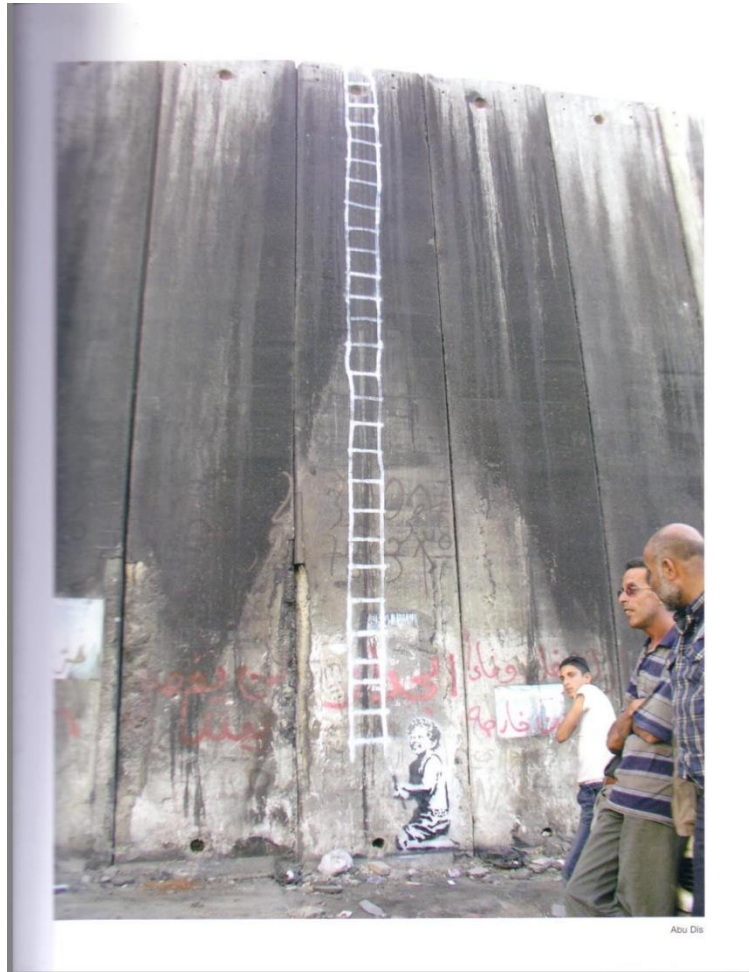
Figure 3. ( Wall and Piece 117 )