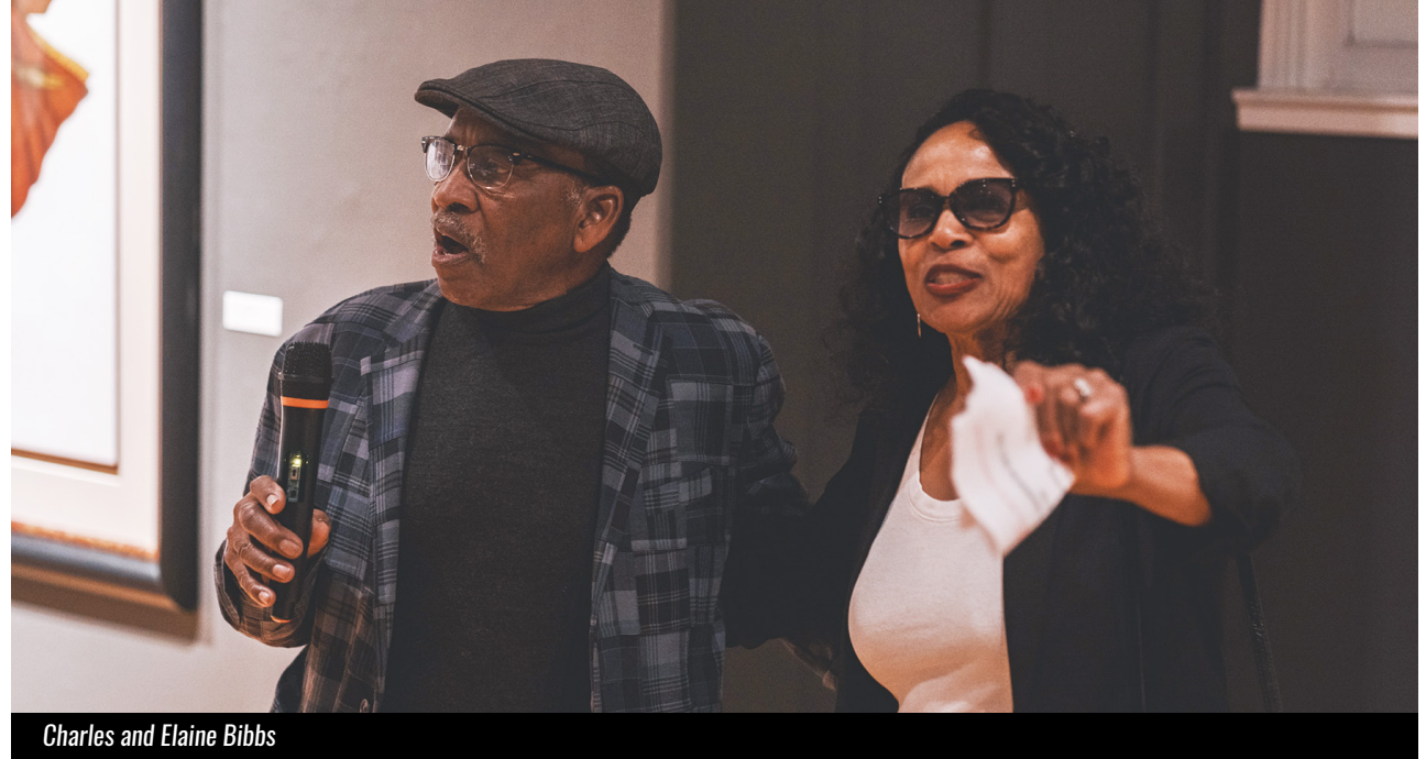
Guest attending the exhibit admiring Charles Bibbs' artwork

Artists from across the country and Inland Empire art lovers joined Inland Empire resident and world renowned fine artist Charles Bibbs and his wife Elaine for the new exhibit SACRED SPACES: The Work and Collection of Charles A. Bibbs that will be on display until March 10, 2024. Bibbs' work displays a unique robust and stylized quality done in combination of abstract and realistic interpretations of contemporary subjects that are fused into beautiful multifaceted ethnicity, larger than life images. For more information on the exhibit, visit the Riverside Art Museum website at Riversideartmuseum.org. Photos continue on page 12.