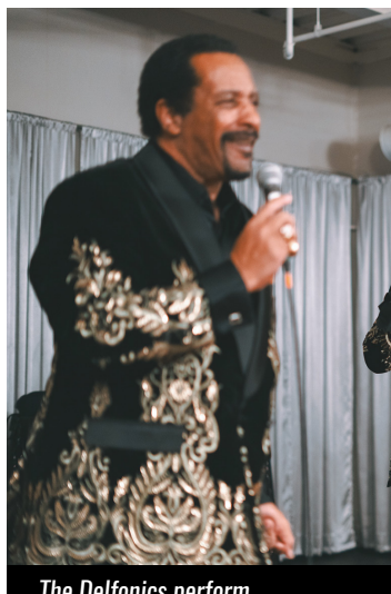
The Delfonics perform