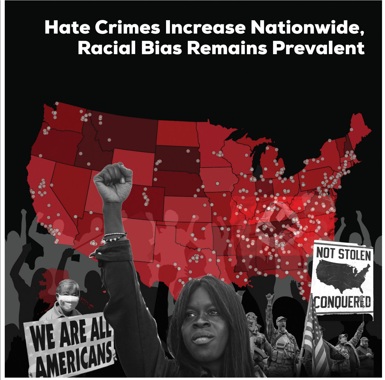
The FBI's recently released 2022 nationwide crime report showed 14,631 law enforcement agencies submitted incident reports. There were 11,634 criminal incidents and 13,337 related offenses reported as being motivated by racial, ethnic, ancestral, religious, sexual orientation, disability, or gender bias.

According to the FBI Crime Data Explorer,