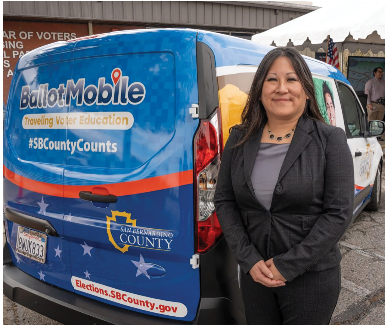
San Bernardino County Registrar of Voters Stephanie Shea stands next to the newly unveiled BallotMobile.

Across more than 20,000 square miles, more than 1.4 million San Bernardino County residents are eligible to vote, but just over 1.1 million were registered as of July 24, 2024. For the nearly 300,000 voters who are not registered, San Bernardino County Registrar of Voters hopes to reach them using the BallotMobile, a traveling