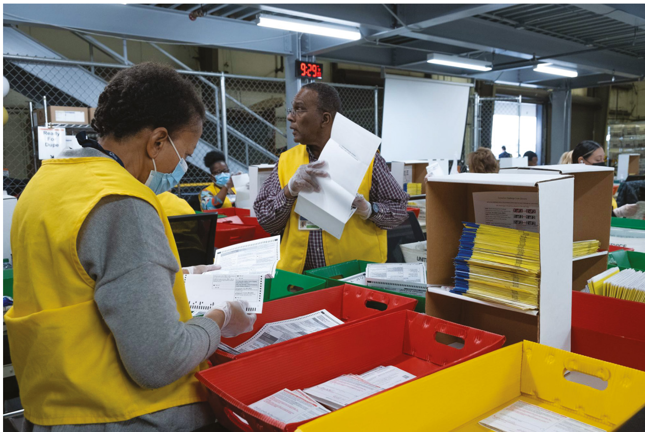
Staff at the San Bernardino Registrar of Voters extract ballots from original envelopes in preparation to scan and organize them by precinct. (Aryana Noroozi, Black Voice News Newsroom / CatchLight Local, November 2, 2022).