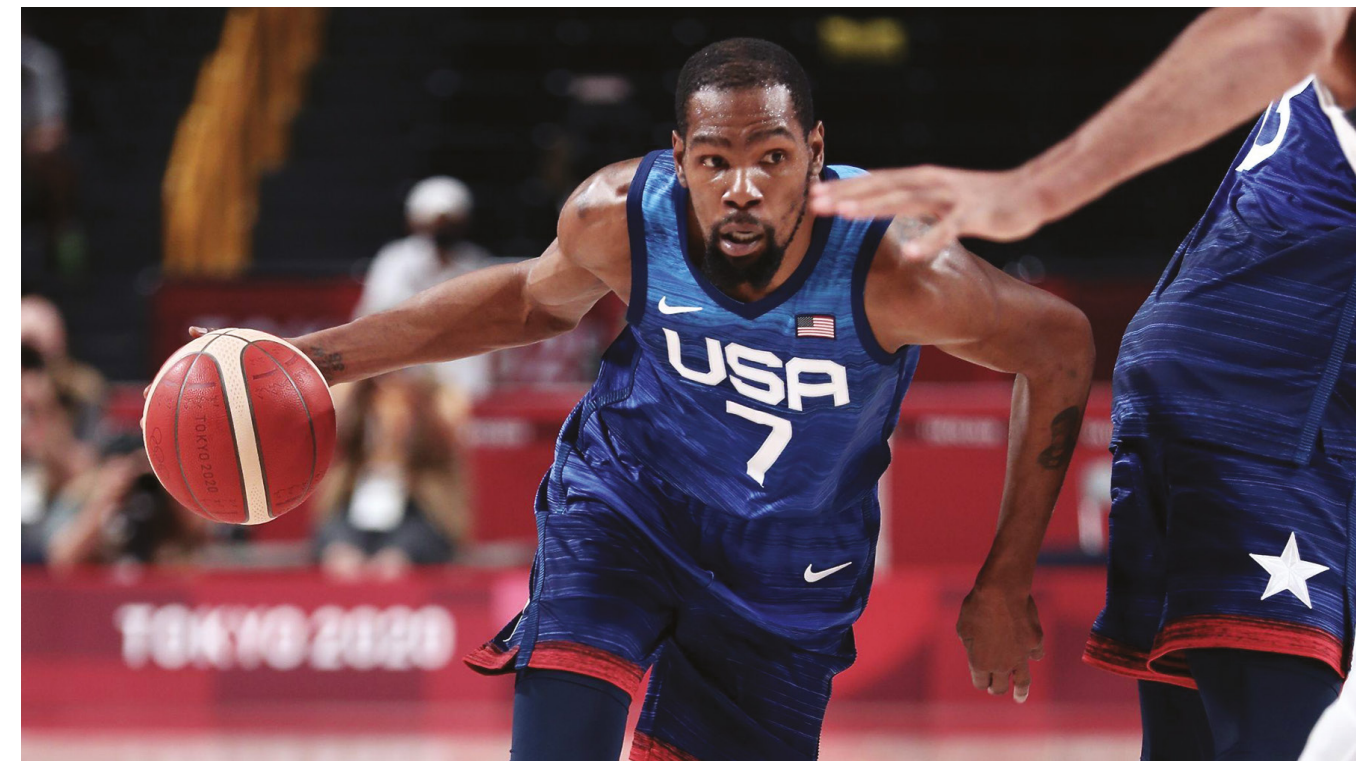
Kevin Durant - playing in his fourth Olympics, breaks the all time US record in points at 435 as USA wins its fifth consecutive gold medal in men's basketball.