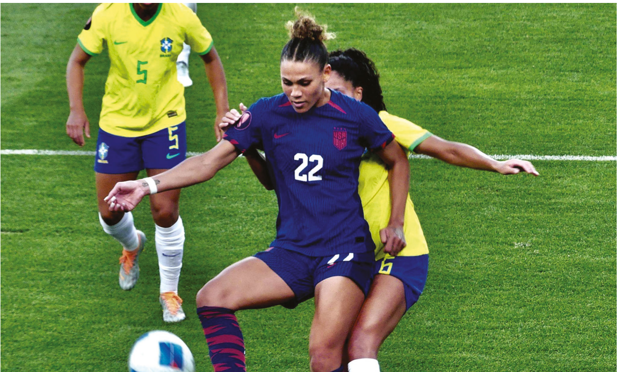
Top: Redemption for Simone Biles - as she overcame the 'twisties' from Tokyo games to win three gold and one silver and reclaim her status as the best ever; Bottom: Team USA Soccer back on top - after missing the medal round in Tokyo, Tiffany Rodman leads an improved US team to gold over Brazil 1-0.