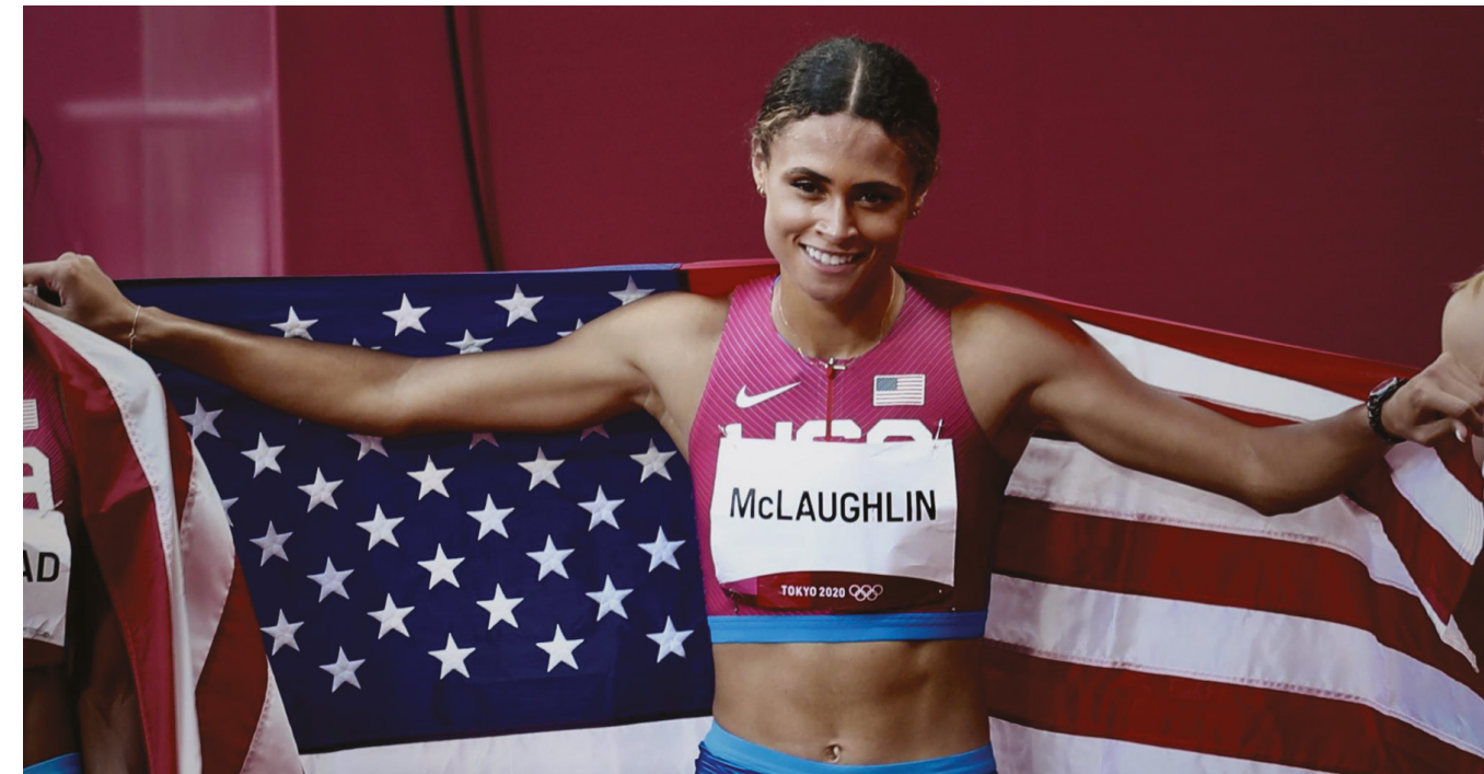
Sydney McLaughlin-Nevrone - broke her own world record winning gold in the 400 meter hurdles in 50.37 and another gold in the 4x400 relay.