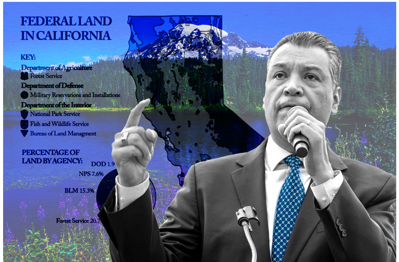
California’s renowned recreational areas, such as Yosemite and Lake Tahoe, face significant overcrowding issues. While online reservation systems have been introduced to manage visitors, there are concerns about these systems exacerbating socioeconomic disparities. (Photo of San Bernardino National Forest.)

“Reservation systems are essential for conserving our public lands and providing visitors the space to enjoy the outdoors. However, we must design these systems to be gateways, not barriers, to nature,” he said.