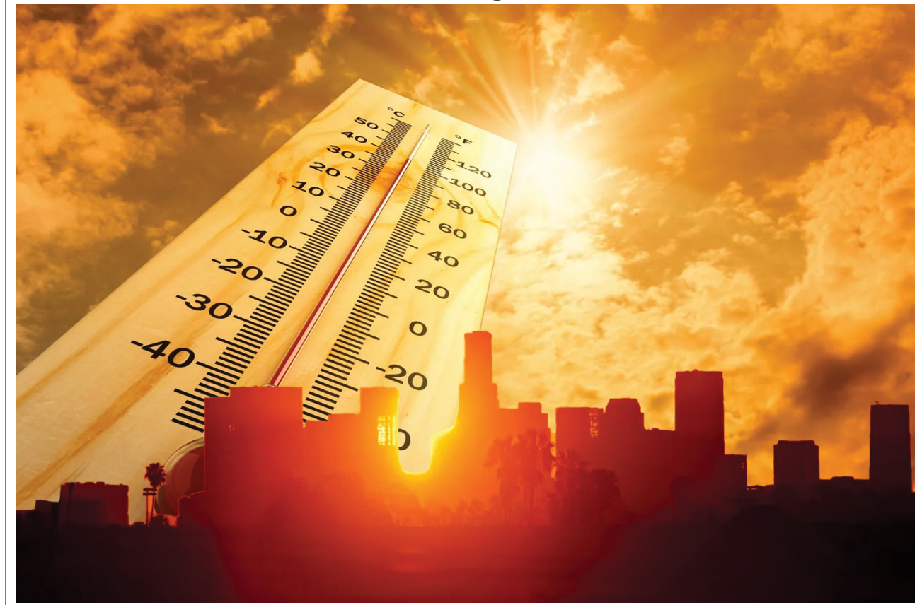
A recent report by the California Department of Insurance found that over 5,000 hospitalizations and nearly 10,600 emergency department (ED) visits were associated with the episodes of extreme heat between 2013 and 2022. Hospitalizations ranged from 60 to 2,132 across events and ED visits ranging from 126 to 4,280. (Graphic by Chris Allen, VOICE)

communities, as well as outdoor workers, are at the highest risk of heat. Black, Native American and Hispanic Californians had the highest rates of heat deaths during the extreme heat events that the report analyzed, compared with Asian and white residents.