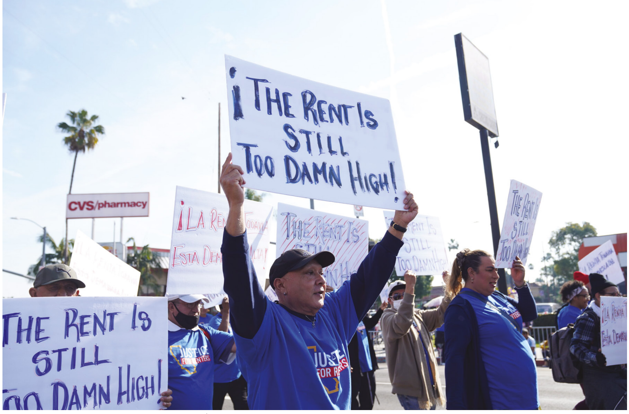
California's average monthly rent in 2021 was $1,818. A new report from the real estate market place company Zillow, shows the median rent for all bedrooms and all property types in California is currently $2,867. (yeson33.org/)

The U.S. Census Bureau reports that "renters make up a much larger share of households in California (44%) than in the rest of the US (35%) and according to the Public Policy Institute of California (PPIC), this percentage has remained fairly consistent for nearly six decades.