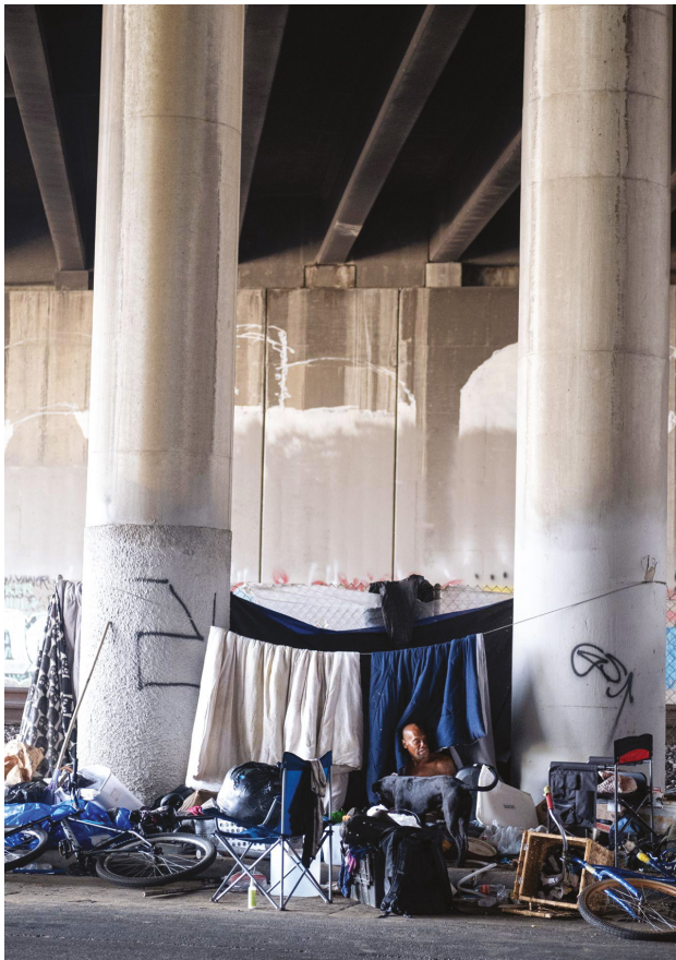
Redbone sits in his encampment which is situated under a bridge and next to a railroad track in Riverside on July 11, 2024.

The Impacts , continued from page 9 challenging for them to manage