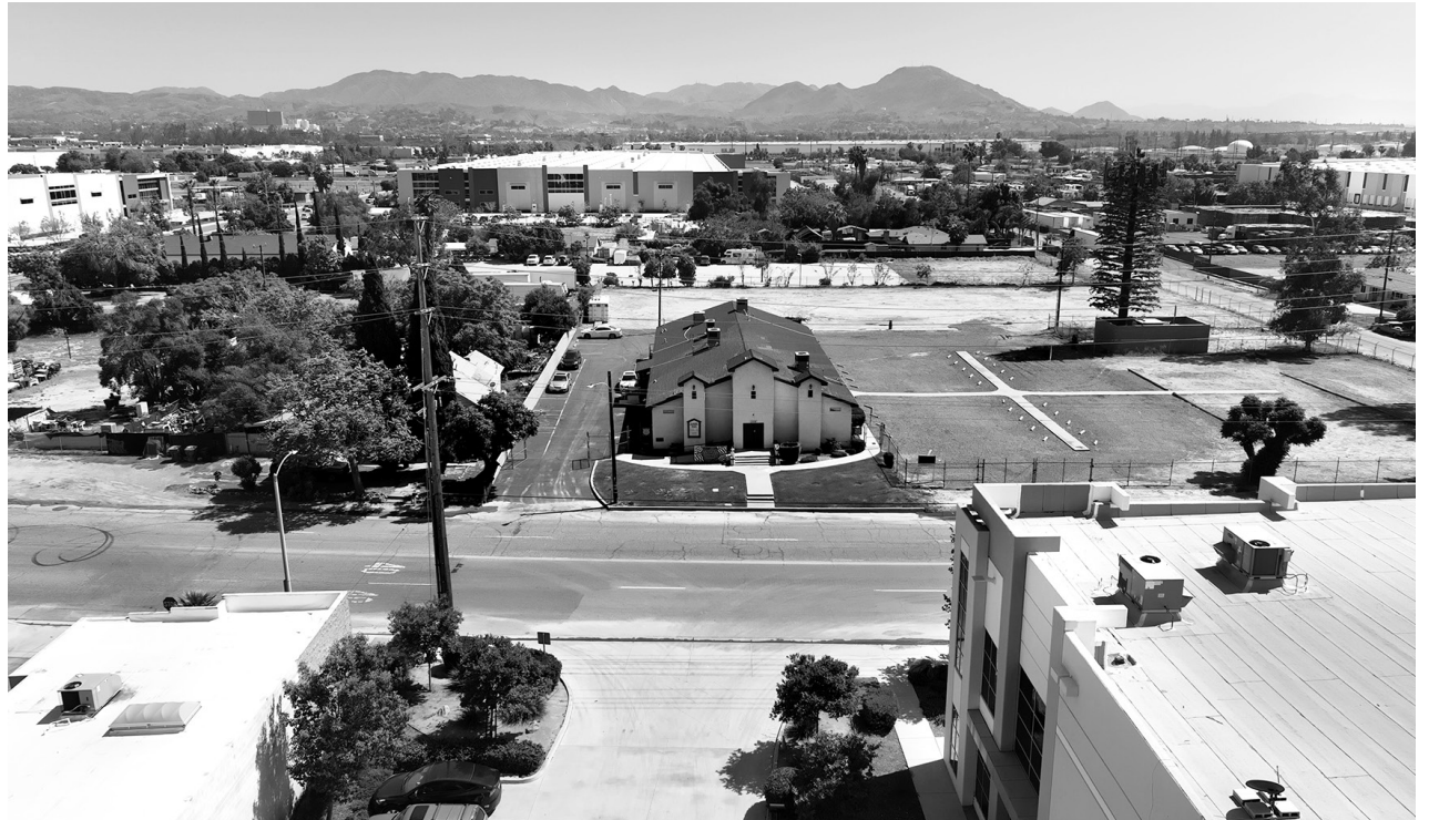
Aerial of St. Mark's Missionary Baptist Church on Central Avenue in San Bernardino, CA.

warehouses, St. Mark's has decided to sell the historic property and eventually move after 95 years as an important congregational space.