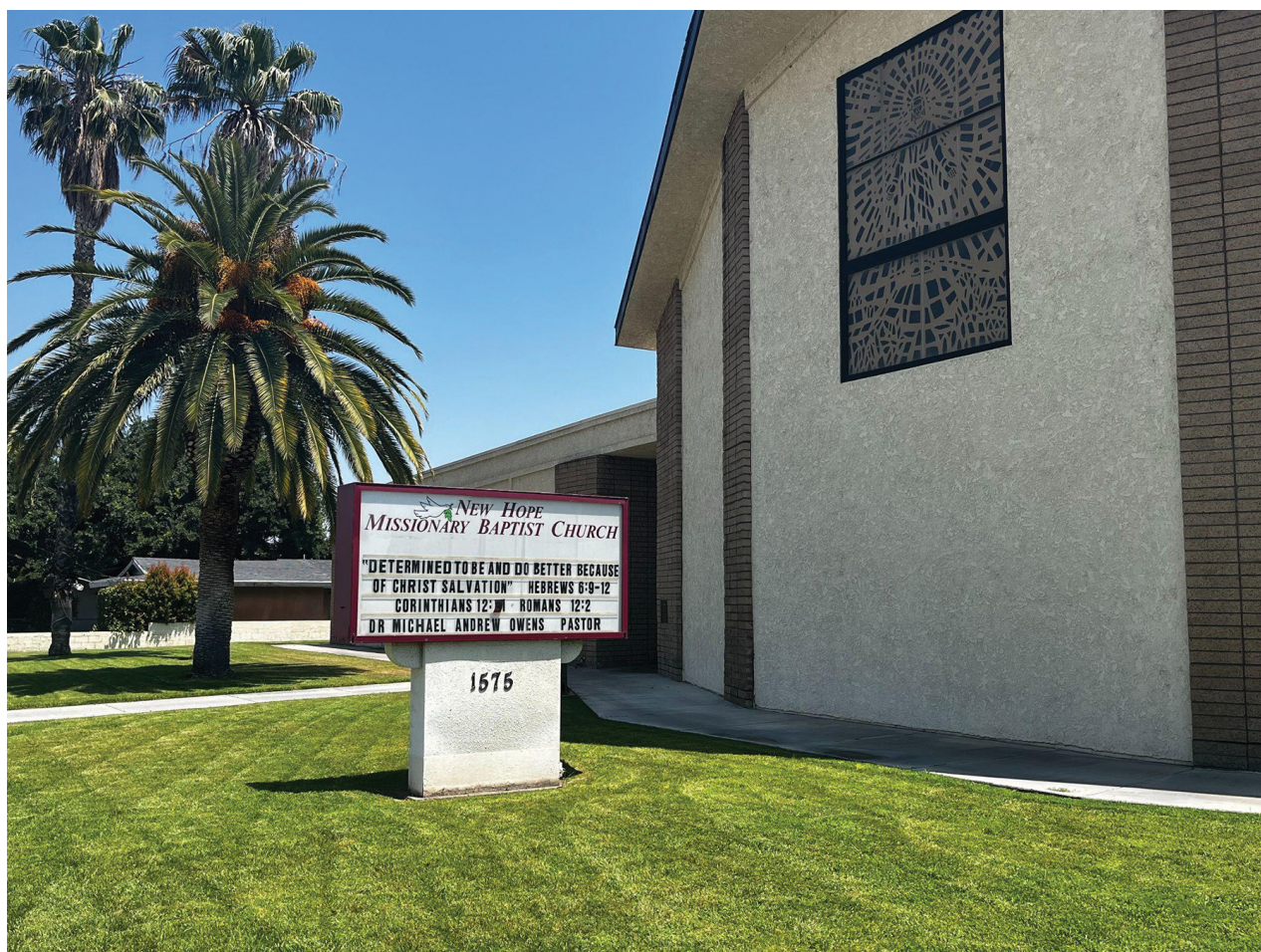
New Hope Missionary Baptist Church was assembled in 1911 as the first predominantly Black Baptist church in San Bernardino. New Hope MBC is participating as an ambassador for the statewide awareness campaign, Take on Alzheimer's.

Prior to joining the Take on Alzheimer's awareness campaign, Wright had surface knowledge about Alzheimer's disease and related dementias. She often used the words interchangeably until she learned through