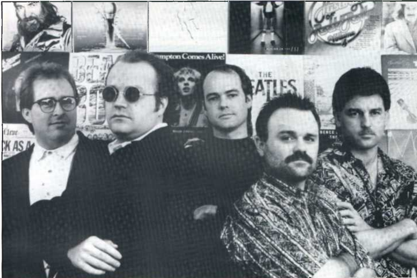
The LCR Band