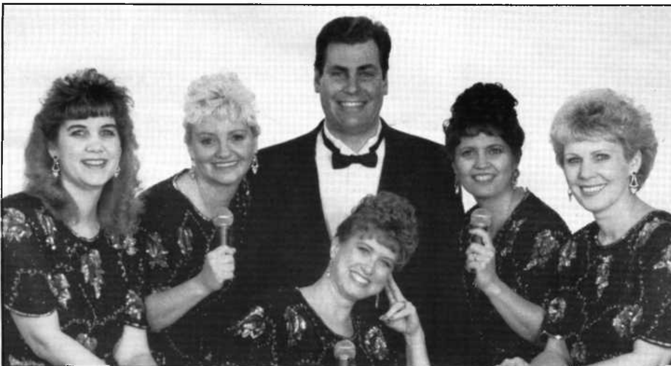
The Swing Sisters Show and Dance Band