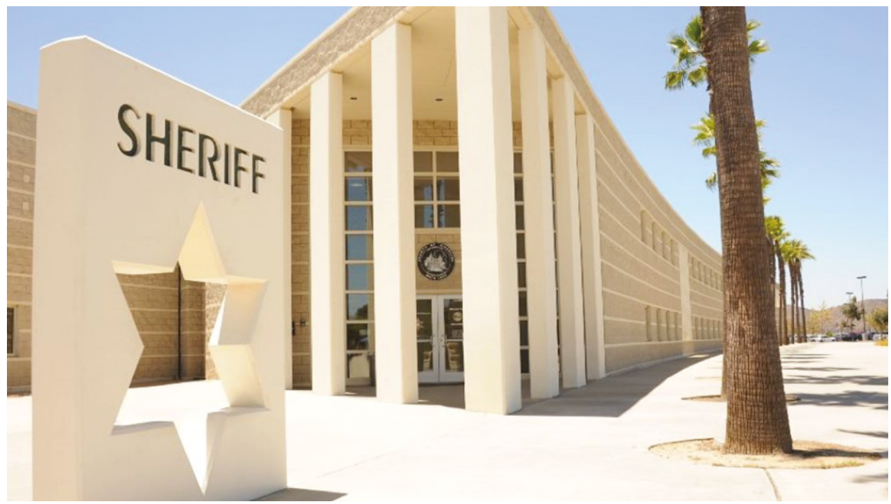
Riverside County Sheriff's Department Southwest Station

Millions of dollars worth of illegal drugs were seized by Riverside authorities last week—the culmination of a nearly year long investigation.