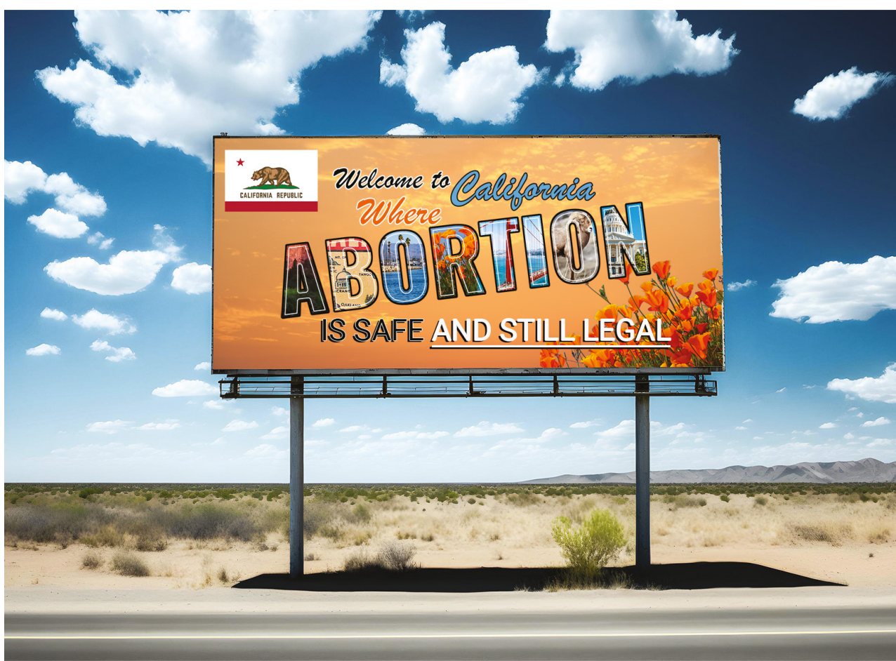
There are currently 21 states that ban or restrict abortion, with Arizona being number 22 if its State Legislature is unable to repeal the state's 1864 ban. (Graphic by Chris Allen, VOICE)

safeguarded patient reproductive records.