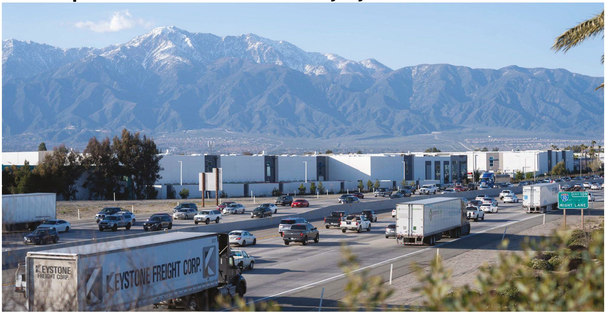
Traffic moves through Ontario on Interstate 215 north on April 4, 2023.

Inland Empire Environmental Justice Community Lays Solutions for Warehouse Growth