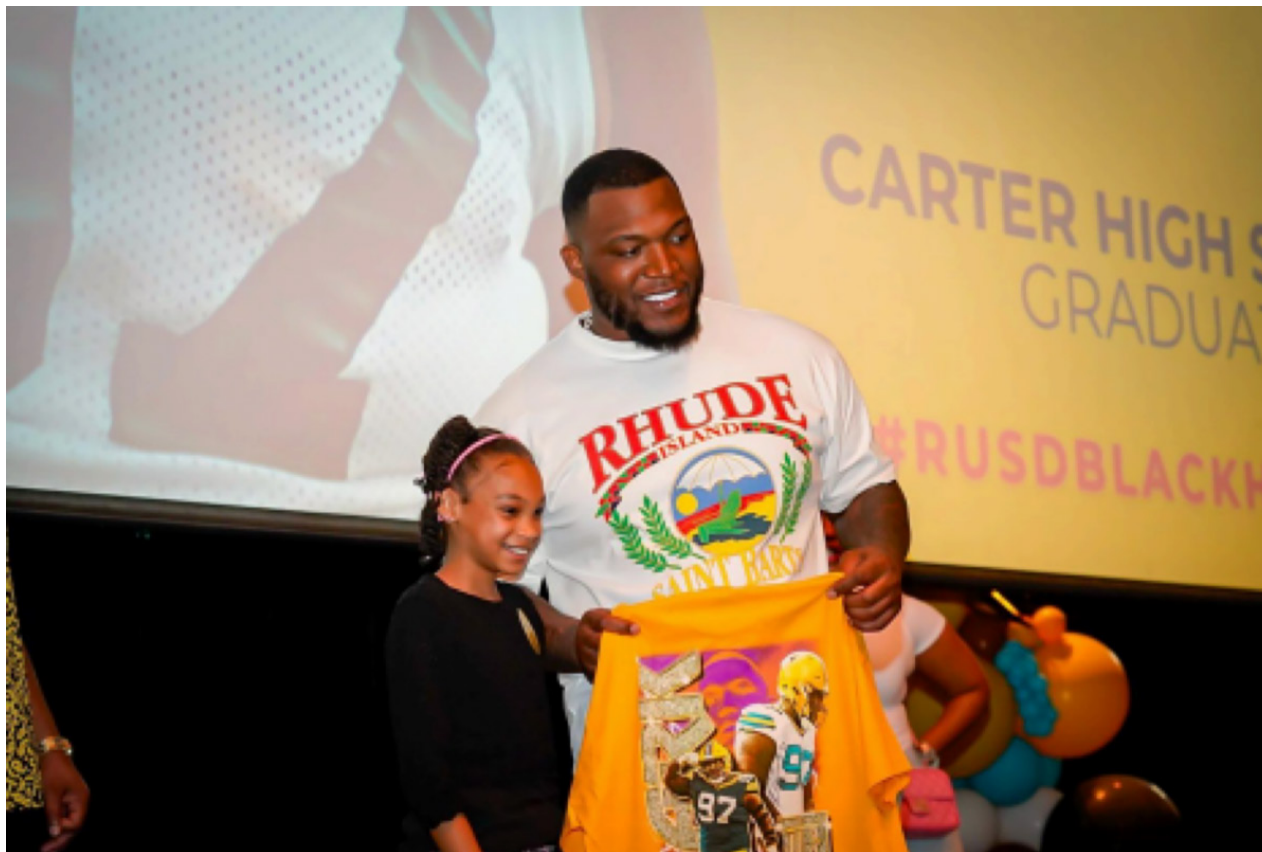
National Football Defensive End Kenny Clark from the Green Bay Packers with a student awardee.