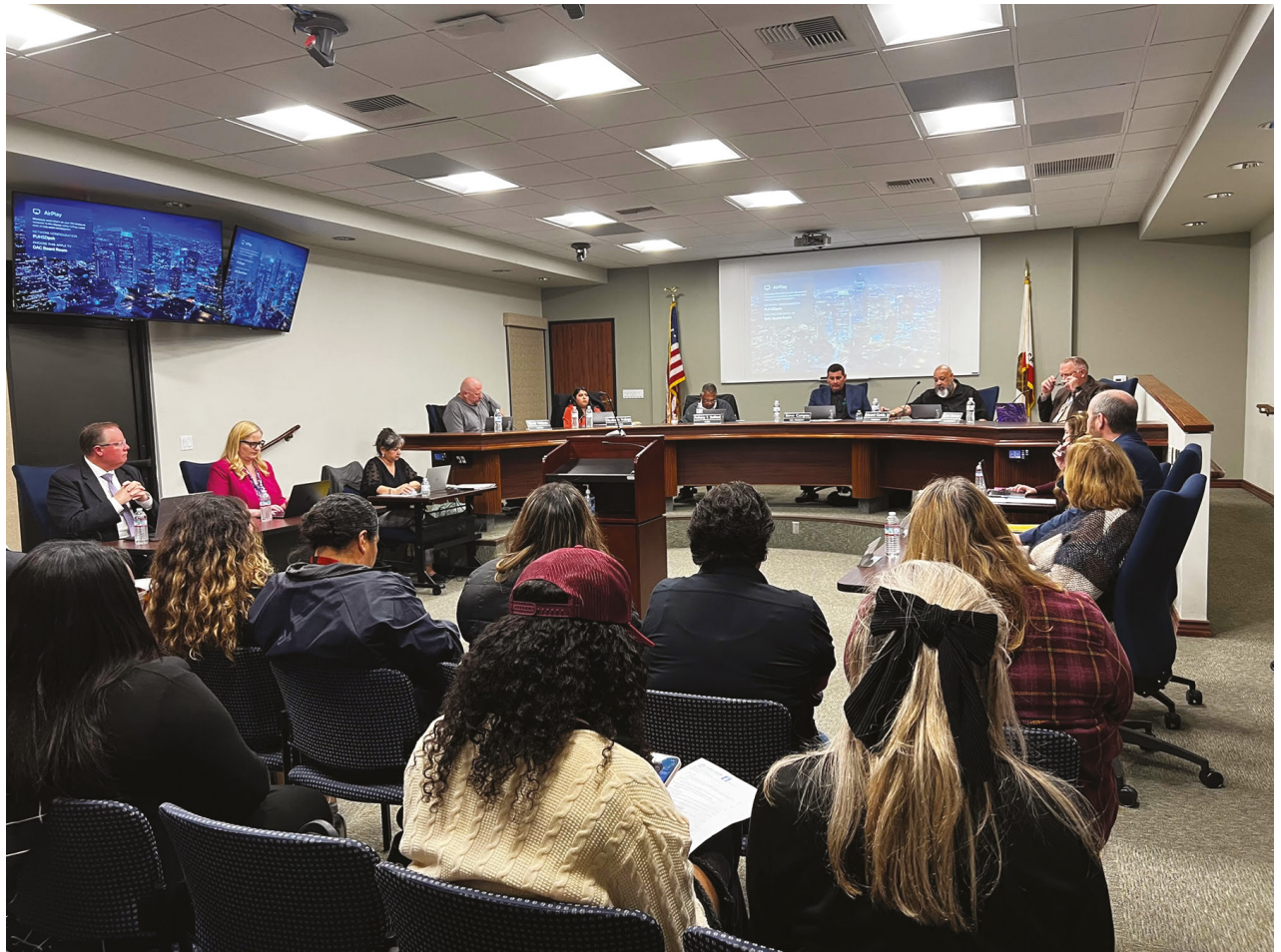
Attendees fill the meeting room as Perris Union High School District holds a special board of trustees meeting on Tuesday, March 5, 2024 in Perris, CA.

specialists and the District Coordinator of Multi-Tiered Systems of Supports during a regular board meeting on February 21, 2024.