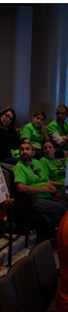
Members of the rapidly growing construction workers union, Laborers' International Union of North America (LIUNA) show their support for the Bloomington Business Park Specific Plan at the San Bernardino County Planning Commission meeting, September 22, 2022.