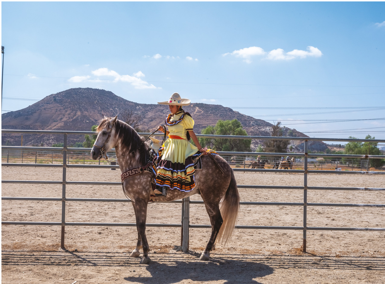
A Bloomington resident wears a Mexican folklórico dress as she rides her horse at the David Jayne Equestrian Arena where residents finished a march protesting the development of the Bloomington Business Park Specific Plan, September 18, 2022. Warehouse developments have continued to vastly expand across the inland region including within the unincorporated area of Bloomington. The community's unique Mexican ranch culture lifestyle faces an ongoing threat from these developments as officials rezone and developers encroach on undeveloped plots of land.

When it comes to development, a look at Bloomington brings the idea of what's at stake front and center. The narratives of the community, its land, and history beg questions of what is to be lost and gained as warehousing continues to expand.