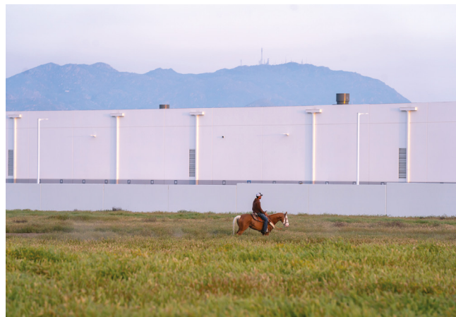
A Bloomington resident rides his horse on an open plot of land in front of an existing warehouse, the Bloomington Commerce Center, on April 11, 2023. The Bloomington Business Park will be built directly across from this existing warehouse, where Walter Zimmerman Elementary School currently stands and, according to Howard Industrial Partners, is projected to be demolished in 2026.