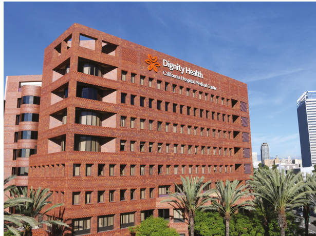
Dignity Health - California Hospital Medical Center shares a legacy of humankindness with Dignity Health.

The organization Journey Out was awarded $90,000. Its project will focus on addressing the community health needs of violence and injury, behavioral health, and housing by providing victims of human trafficking with emotional and mental health services, case management and connections to community services, and emergency housing needs. In addition, Journey Out will collaborate with the Medical Safe Haven Program, SISTAHFRIENDS, and Jenesse Center to serve human trafficking victims with a whole-person approach, as well as provide victims with the support services they need to move their