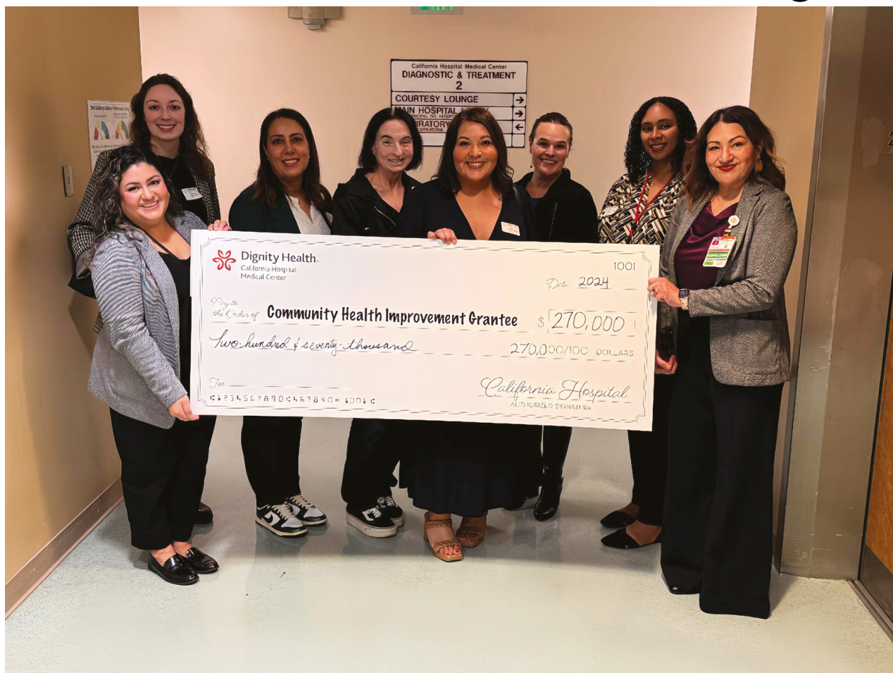
$270,000 in grants awarded through Dignity Health's Community Health Improvement Grants program to 3 nonprofits in Los Angeles.

impact in the lives of the most underserved populations in Los Angeles.”