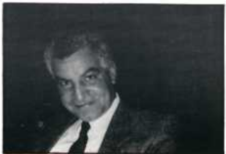
Prof. Zahi Hawass

The world's leading authority on Old Kingdom pyramids, Prof. Zahi Hawass, will discuss the discovery of another pyramid in the Cheops complex on Friday, Sept. 23 at Cal State, San Bernardino. His lecture is free and begins at 7:30 p.m. in the Recital Hall. As an Egyptologist, Hawass has been the director general of the Giza Plateau since 1987. His expertise