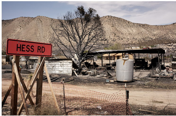
Along the 138 Highway.