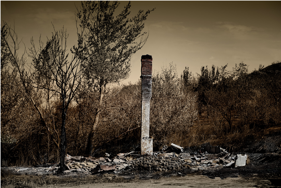
The last remains of the historic Earp Cabin on Clyde Ranch.