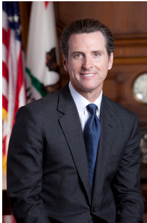
Gov. Gavin Newsom

In the year ahead, we'll continue to work hard and aim high on behalf of all Californians, and everyone who looks to our state as a beacon of hope.