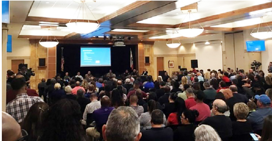
SCE power shutoff meeting at Chamber of Commerce in Fontana

For residents who missed the meeting a YouTube Video of the entire meeting is available online.