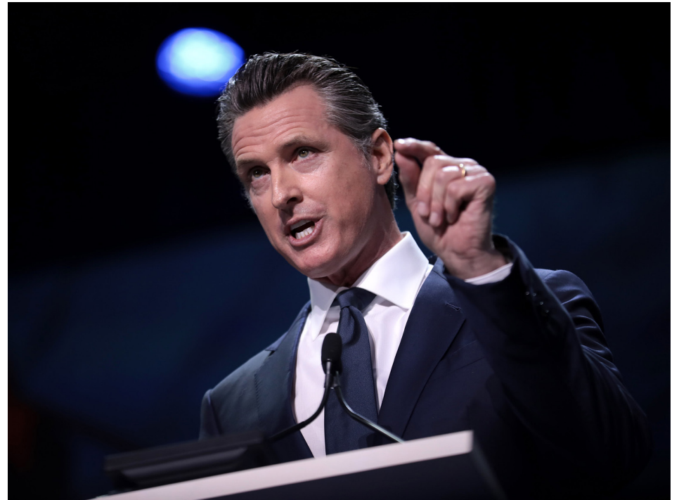
Gov. Gavin Newsom