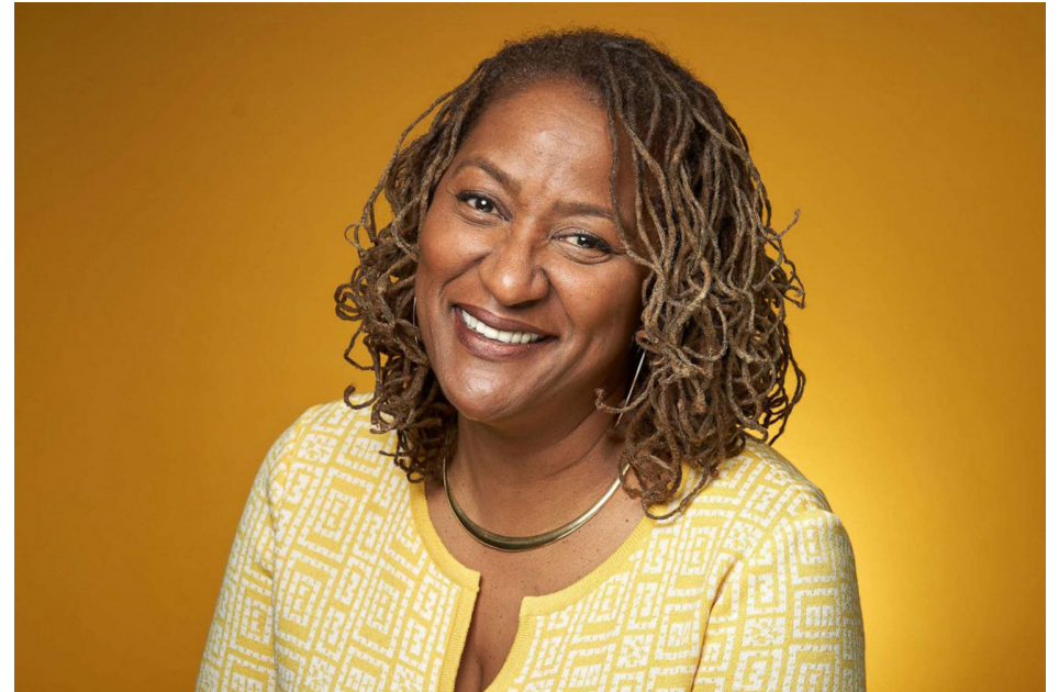
Senator Holly Mitchell