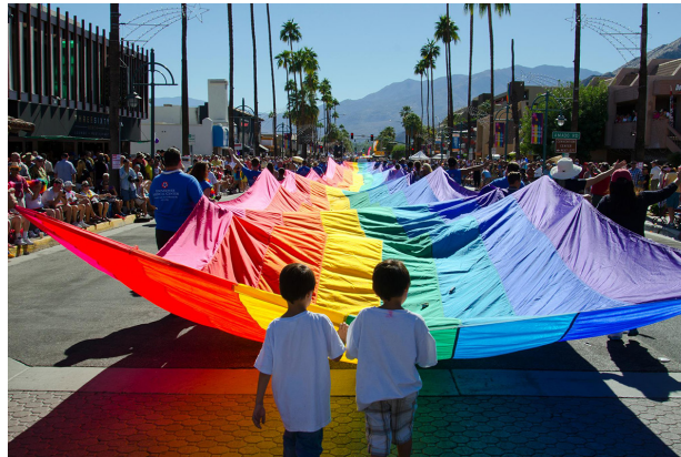
Palm Springs Pride Parade