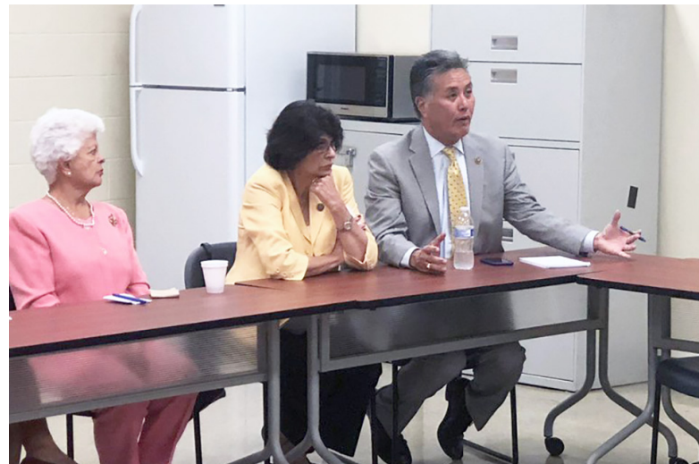
Rep. Mark Takano meeting with ADC administration

This approach is not too dissimilar from the tactics of using inmates as workers in prisons across the country—always for exploitative wages. It appears GEO pockets the exorbitant compensation it receives from the federal government at the expense of taxpayers to operate the facility and rather than