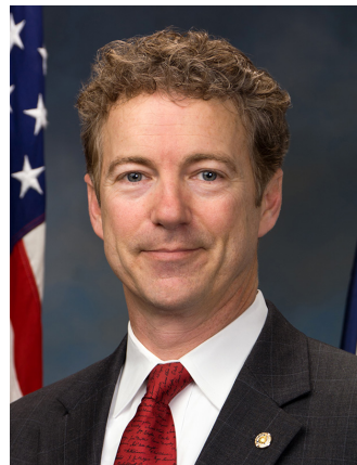
Senator Rand Paul's social media account was recently suspended for seven days.