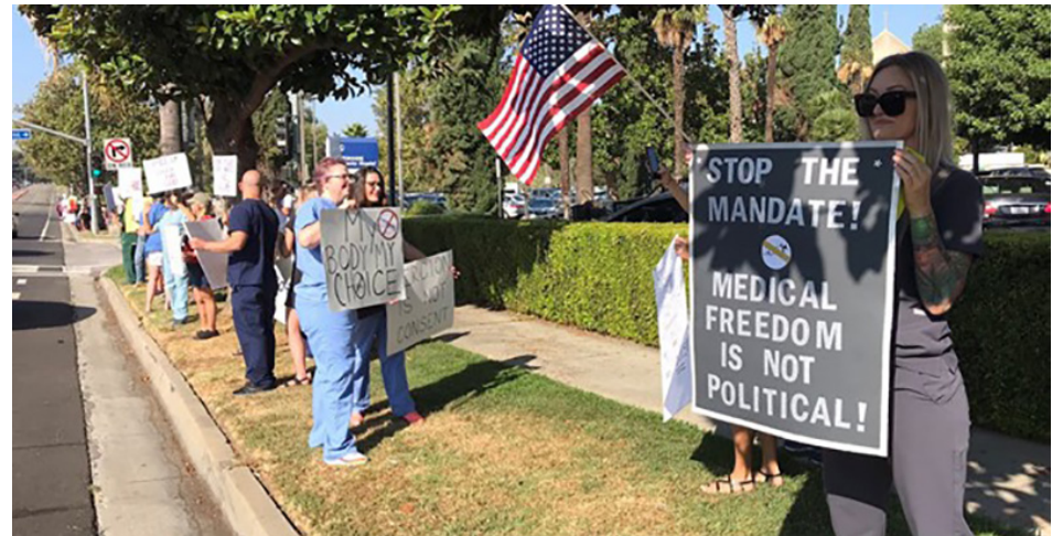
Demonstrators gathered outside of Riverside Community Hospital on August 9, 2021 in Riverside, CA to oppose Newsom's vaccination mandate.

Combating COVID-19, continued from page 5