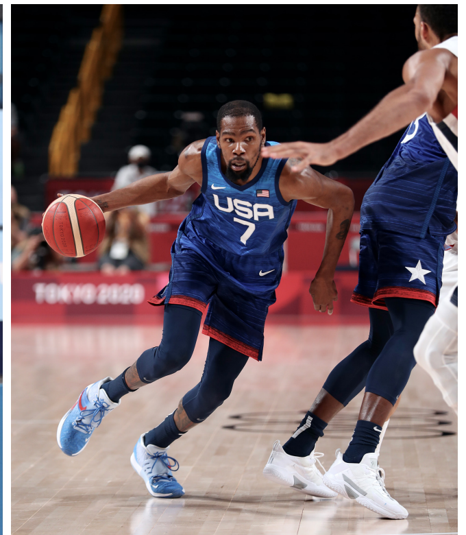
Top: Members of the women's gymnastics team show love to supporters during competition. Bottom left: Women's gymnastics team awarded silver medal. Bottom right: Kevin Durant becomes the leading all-time Olympic point scorer in basketball.