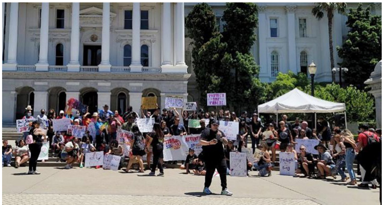
Professionals in the cosmetology and barbering industry protest SB 803 at the state capitol.