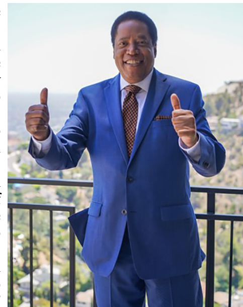
Conservative talk radio host and recall election candidate smiles with two thumbs up after a Sacramento court ruled that he will be listed on the recall ballot.