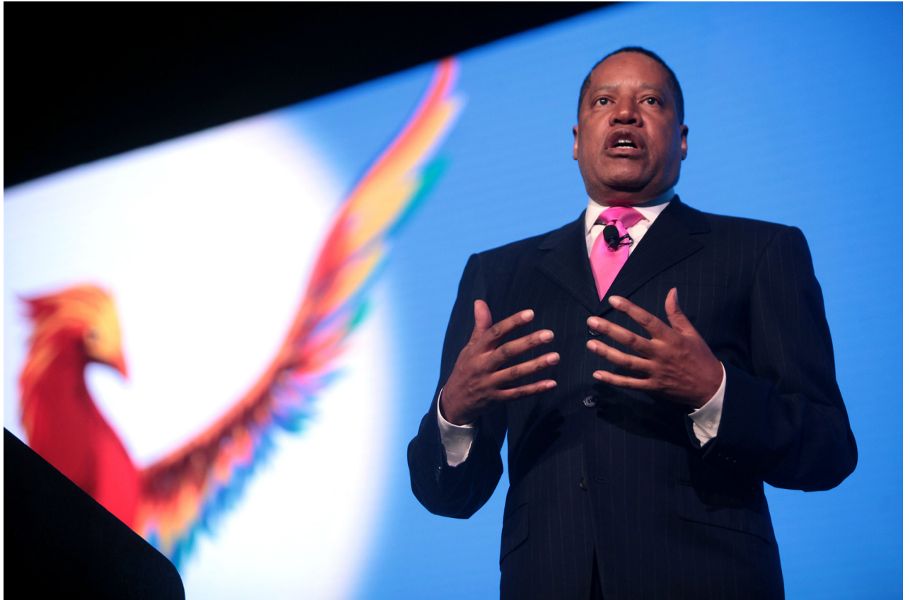
Larry Elder speaking at the 2016 FreedomFest at Planet Hollywood in Las Vegas, Nevada.

Since filing his candidacy, Elder has been using social media platforms to express his views on homelessness in California, education, and the city of Los Angeles' mandate to wear face masks indoors, including for individuals who are fully vaccinated.