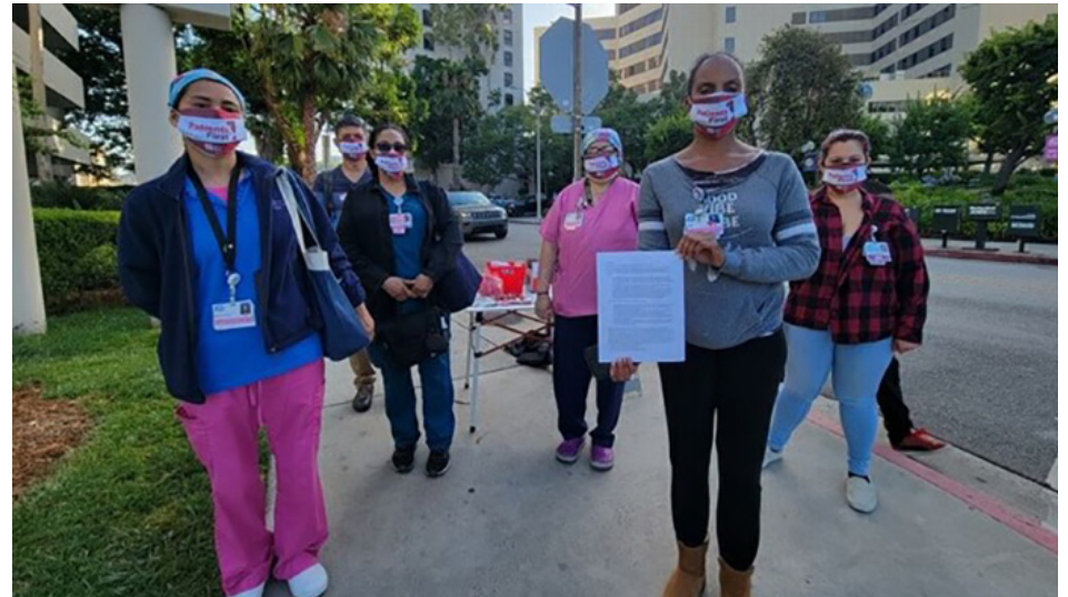
“#ProtectNurses! Protect public health! Put patients first! The pandemic is not over. Today, we join with nurses around the country to demand our employers address serious safety issues including PPE and #SafeStaffing!” Tweet from California Nurses Association