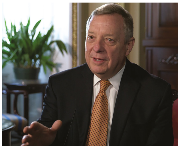
Majority Whip and Chair of the Senate Judiciary Committee Richard “Dick” Durbin.

very experienced. I think she brings a dynamic background to the position, her upbringing, her