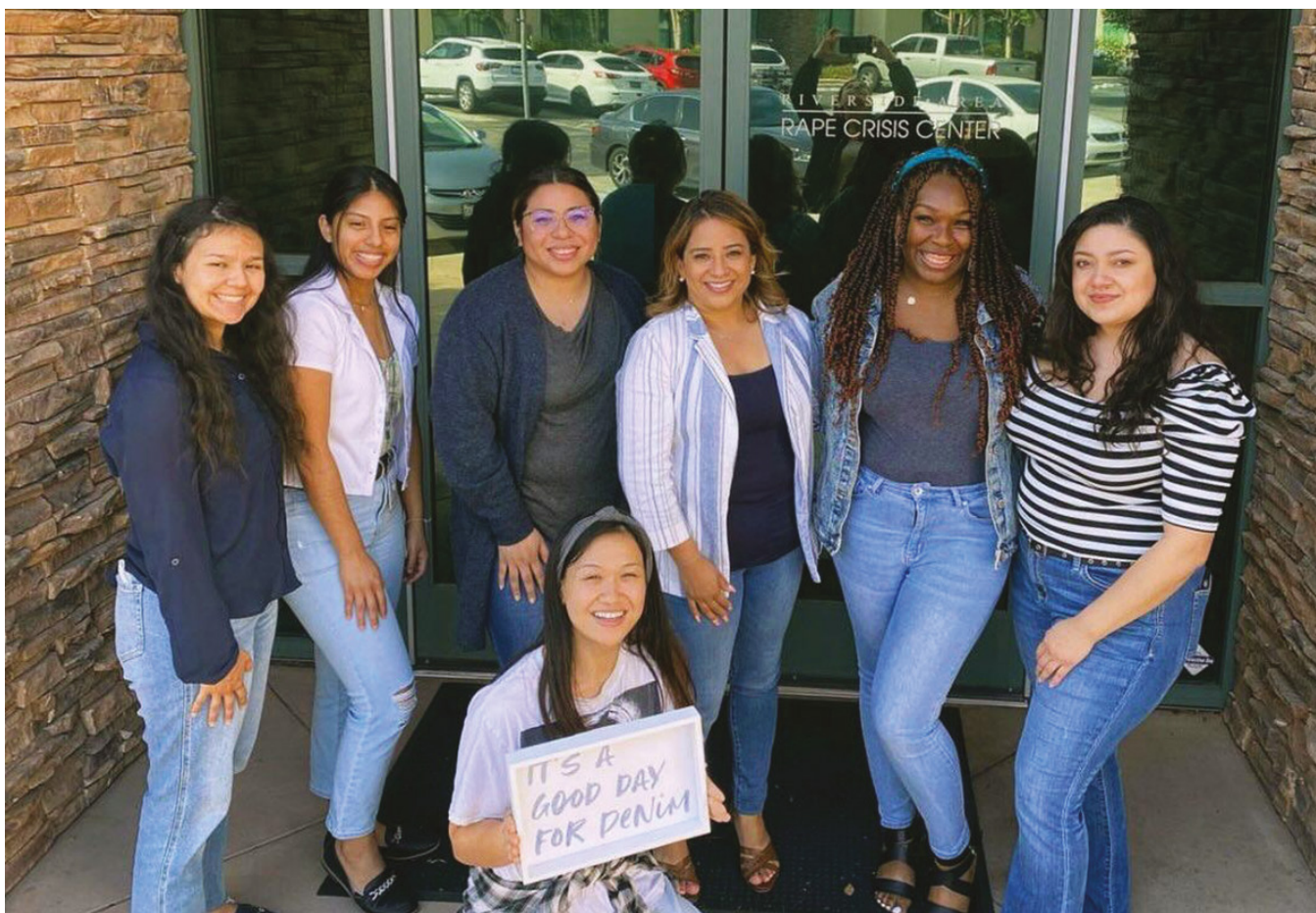
April is Sexual Assault Awareness Month and the last Wednesday in April marks “Denim Day.” Denim Day is a day of action where people are encouraged to wear denim in order to address victim blaming and to educate people about sexual assault. Riverside Area Rape Crisis Center (RARCC) staff wear denim to bring awareness about sexual violence.