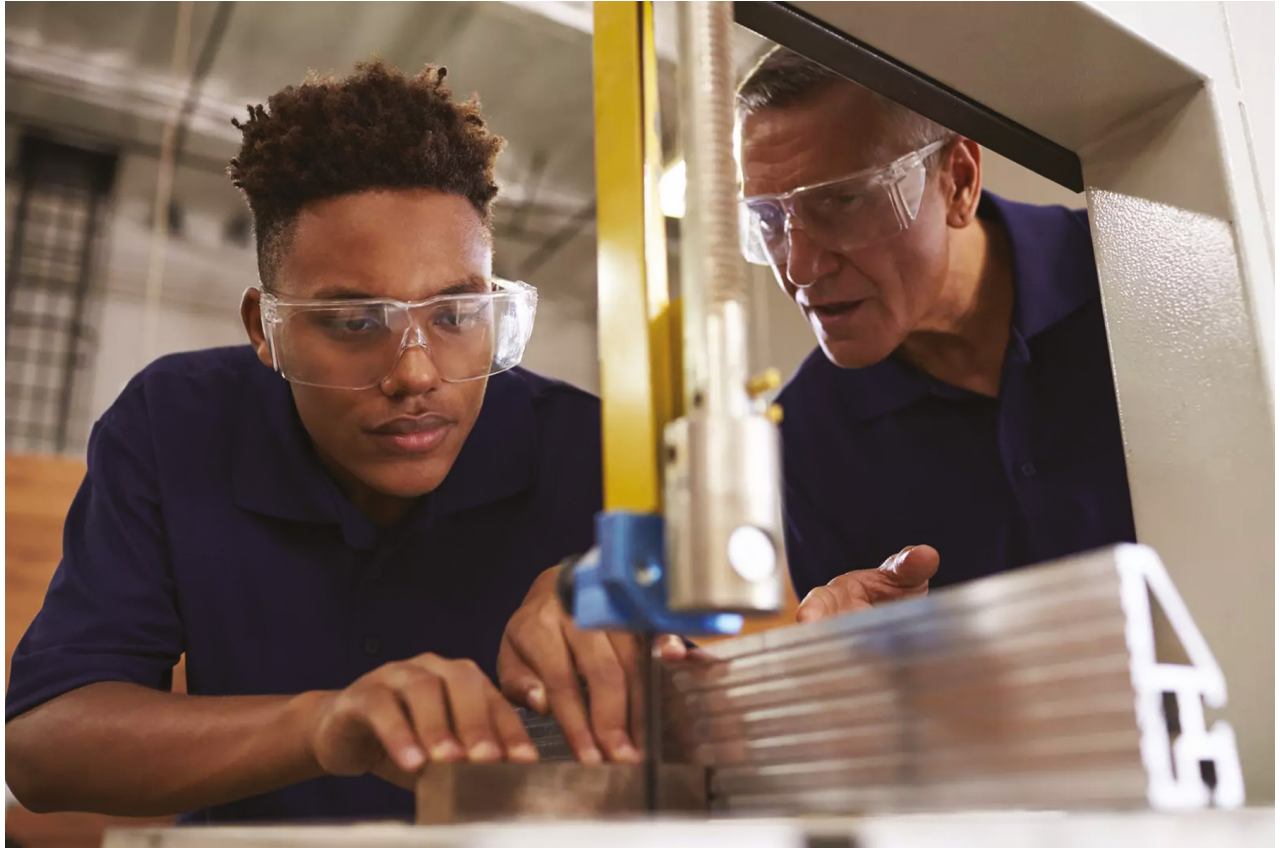
The Youth Action Project (YAP) is working with its participants and partners to build strong pathways for local youth and young adults to achieve their career goals.(image source: weforum.org).

Bernardino but earn median incomes below county average along with Black, Pacific Islander and Indigenous residents.