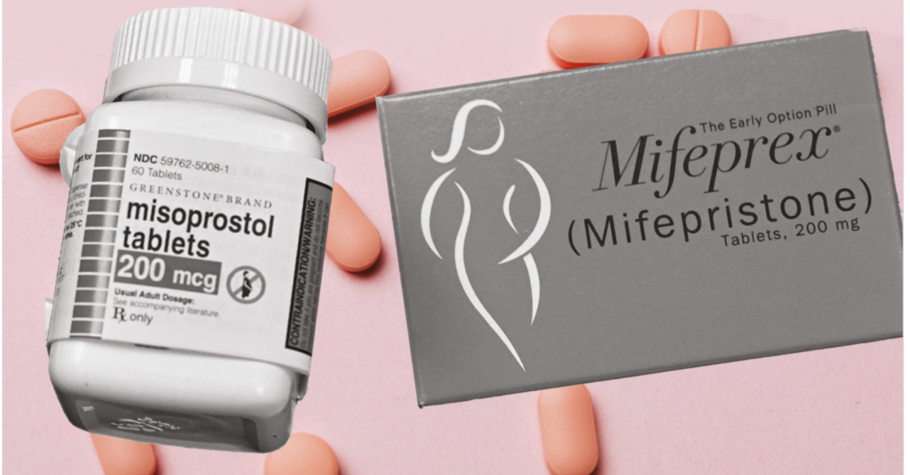
Mifepristone is a drug that, when used together with another medicine called misoprostol, is used to end a pregnancy.

decision,” President Biden said in a statement. “But let’s be clear – the only way to stop those who are committed to taking away women’s rights and freedoms in every state is to elect a Congress who will pass a law restoring Roe versus Wade.”