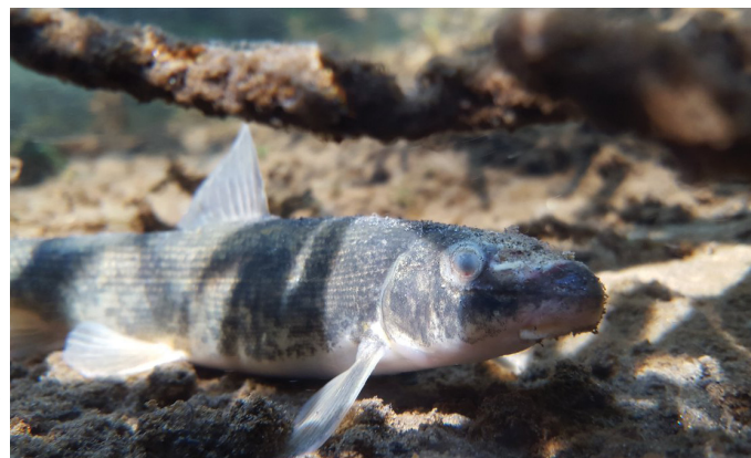
Santa Ana Sucker: The Lake Rialto habitat project will offer significant environmental benefits to critical species such as the endangered Santa Ana sucker and Arroyo chub.

The Lake Rialto project is not just environmentally beneficial, but also a