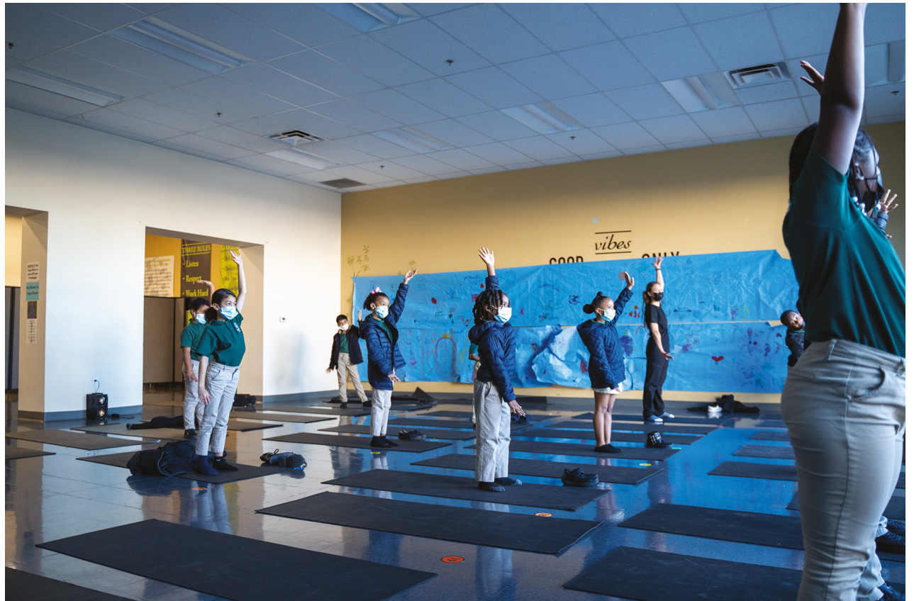
Hardy Brown College Prep starts the week off right by having the students stretch, balance, and meditate.

The Fortune School, continued from page 4