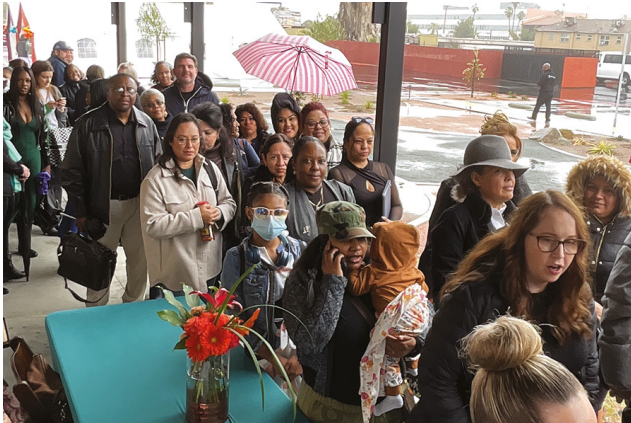
Community members from San Bernardino and surrounding cities in Southern California line up to enter the B-BOP center for the first time.