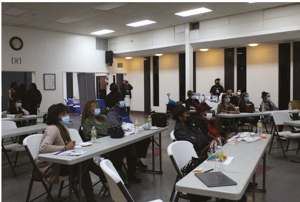
Community members listen to a presentation on COVID-19 during a town hall event hosted by the Centers for Healthy Communities in the fellowship hall at the Ecclesia Christian Fellowship church in San Bernardino, CA on Nov. 30, 2022.

lifestyles, achieving optimal health and not physically looking a certain way, just being healthy as human beings, and the importance of making that a priority. Because if you don't have good health, you don't have a good quality of life.