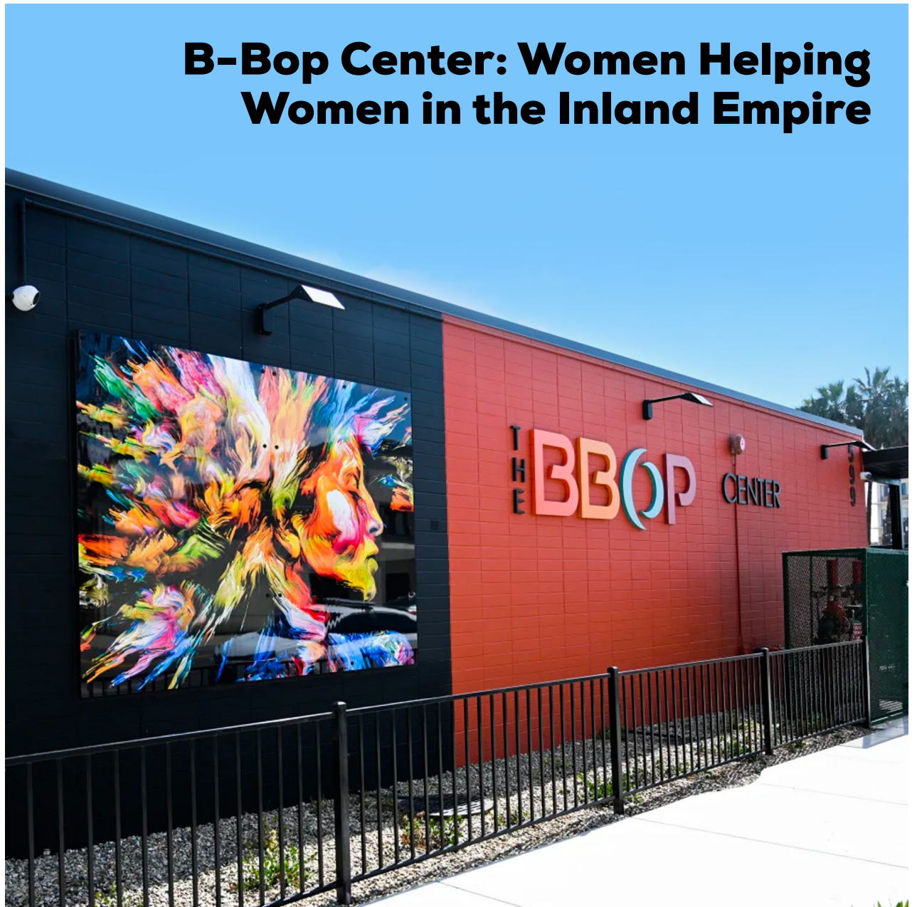
On Wednesday, March 15th, The Black and Brown Opportunities for Profit(B-BOP) Center opened its doors for the first time to an enthusiastic crowd.