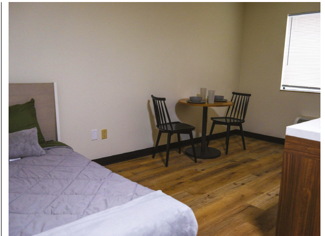
A single occupancy unit is prepared for a resident to move in March. This unit is one of the 76 fully-furnished 250-square-foot apartments with a TV, kitchen, and high-speed internet. The building will be home to chronically unhoused seniors and is equipped to support the community, with onsite social and mental health services and professionals, including a live-in manager. (Aryana Noroozi for Black Voice News / CatchLight Local).

Two large murals of unhoused individuals painted on the back of the building are intended to show that there is a brighter side of what the new housing unit can be. (Aryana Noroozi for Black Voice News / CatchLight Local).