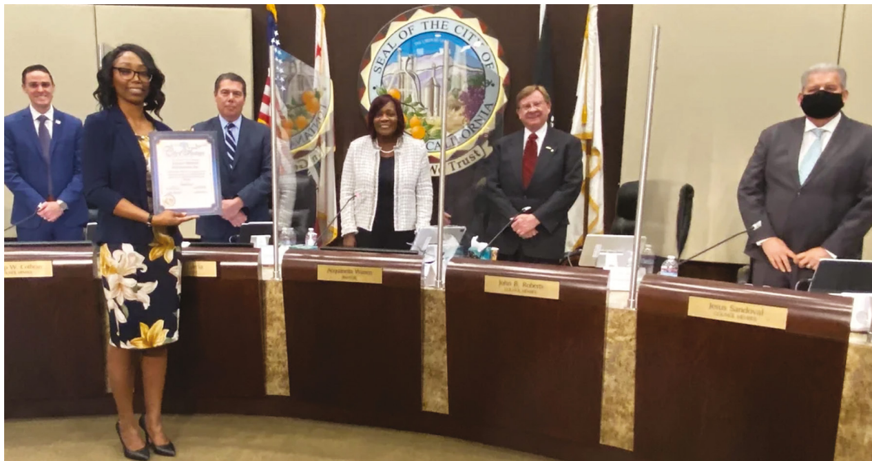
The Legacy Bridges Foundation, Inc. was recognized by the City of Fontana Mayor, Acquanetta Warren and the Fontana City Council for its "continuous commitment in raising awareness about epilepsy and providing support to those in need." Thanking the foundation for its "commitment to the community".