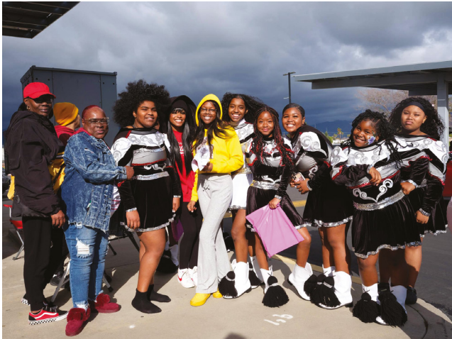
Members of the San Bernardino PaceSetter drill team pose for a photo at the Martin Luther King Parade and Extravaganza on January 16, 2023.