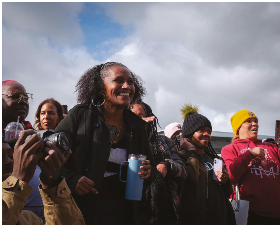
The crowd cheers and dances to J.J. Fad's performance at the Martin Luther King Parade and Extravaganza on January 16, 2023.