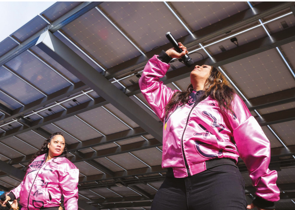
Rialto natives, J.J. Fad perform their hit song "Supersonic," at the Martin Luther King Parade and Extravaganza on January 16, 2023. "Supersonic" reached #10 on Billboard Hot Dance/Club Play Songs and was nominated for a Grammy Award for Best Rap Performance in 1989, making J.J. Fad the first all-female rap group to be nominated for a Grammy award.