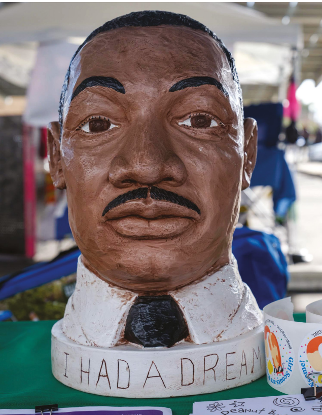
A Martin Luther King Jr. statue sits in the Girl Scouts of San Geronio booth at the Martin Luther King Parade and Extravaganza in San Bernardino on January 16, 2023.