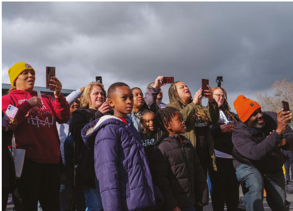
The crowd watches and sings along to J.J. Fad's performance at the Martin Luther King Parade and Extravaganza on January 16, 2023.