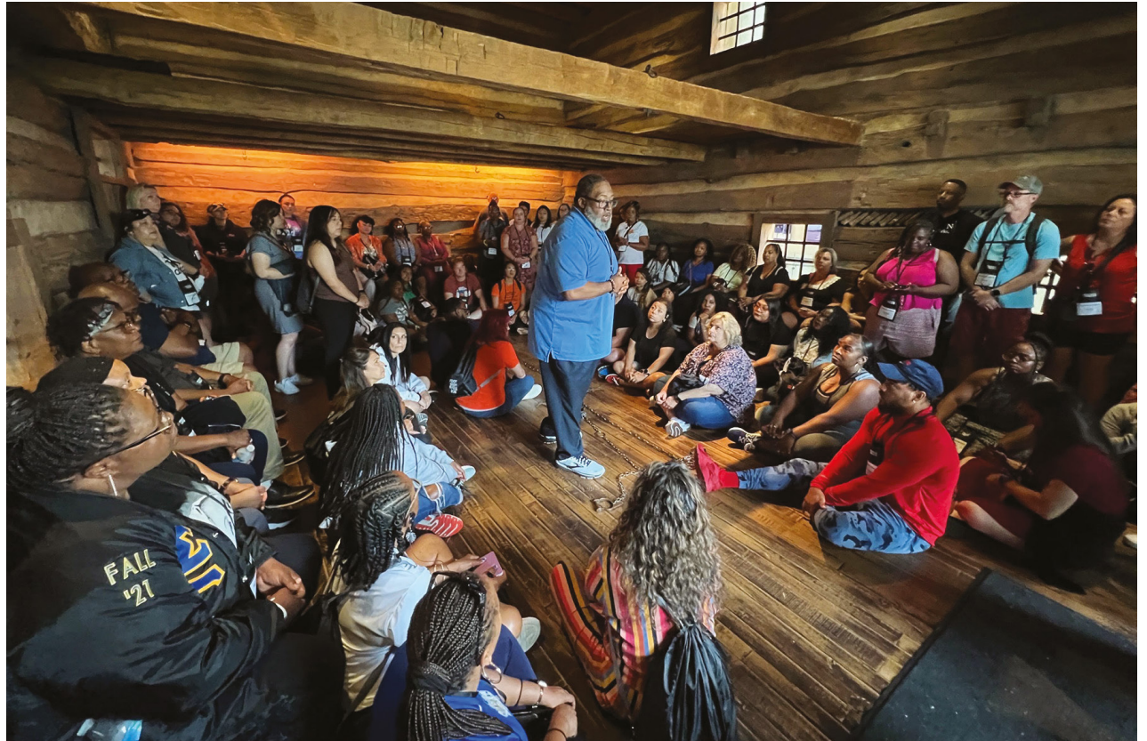
Participants learn about the slave pen originally found in Mason County Kentucky and currently housed in the Freedom Center in Cincinnati.

For over 25 years, the Footsteps to Freedom Study Tours have provided educators and others with insights into the history of the Underground Railroad. This year marked a milestone as it became the most attended season in the tour's history.