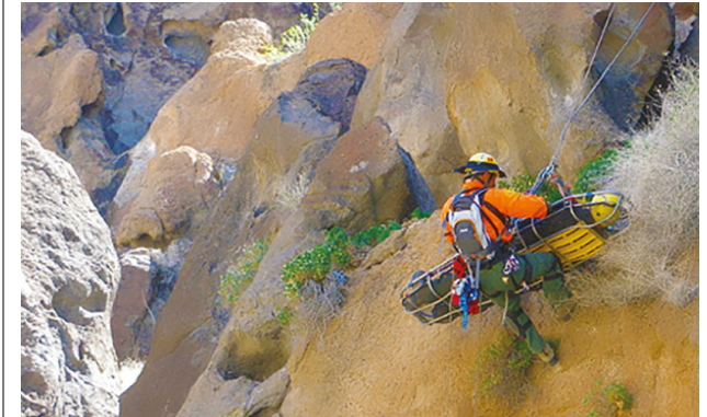
Along with the financial costs, rescue missions are also dangerous for those involved.

SB County Sheriff , continued from page 4