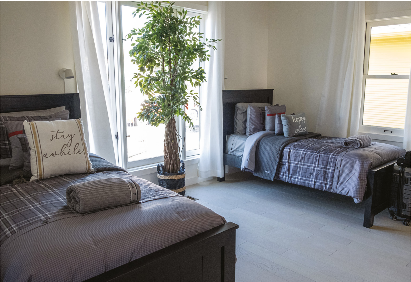
The interior of a bedroom at one of the homes at the Project Legacy campus.