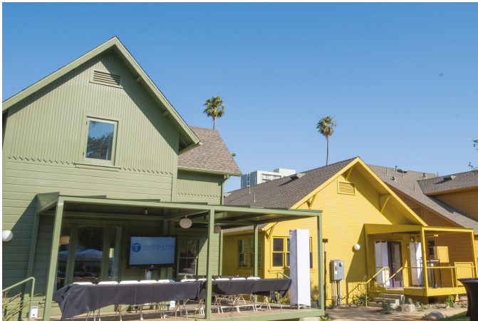
The exterior view of the homes at the Project Legacy campus.