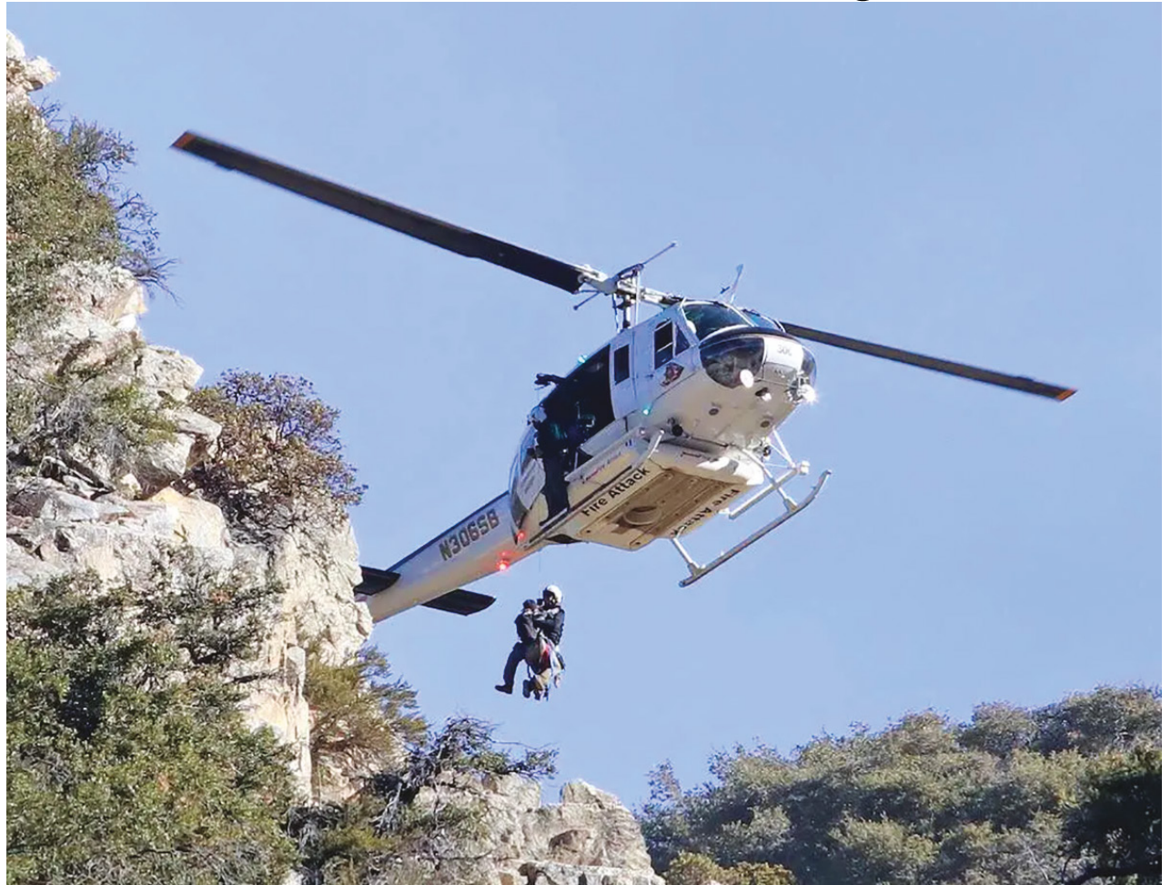
Being hoisted to safety is Bethany Sloan from the top of Big Falls in January of 2018.