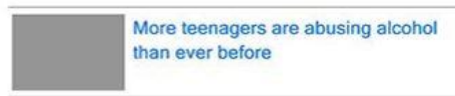
Figure 2. An example of a news headline presentation in the experiment

An example of the presentation of a headline is shown in Figure 2.