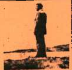
JACK LEMMON "SAVE THE TIGER" 2

TONIGHT'S MOVIE - SHOWING 6 P.M. and 8:30 P.M. PS-10 FREE