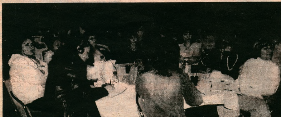
Indio School District was represented, above, at the Parent Symposium. School districts from throughout Southern California also sent representatives.