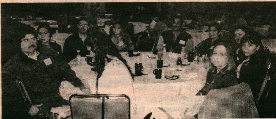
Parents from the Menifee School District listen attentively to speakers at the Parent Symposium sponsored by the Family Involvement Network.