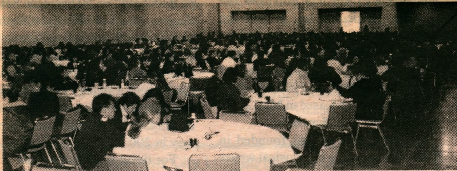
A view of the audience participating at the Parent Symposium.

For information on the program, persons call Antonia Zupancich at (909) 826-6601 or Maria Huizar at (909) 386-2696.