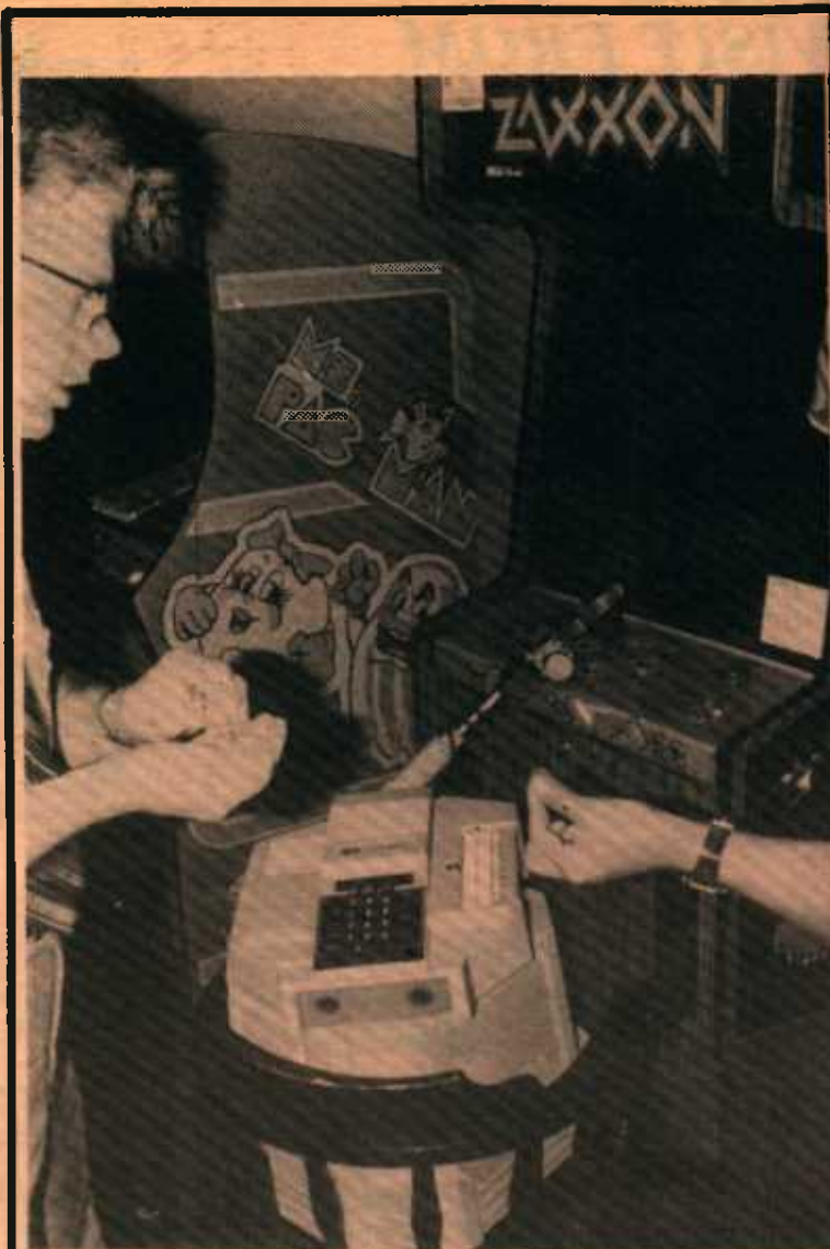
Hero 1 tries his hand(or whatever) at the video games on a recent visit to the pub.

critic have in making or breaking a TV show, upcoming TV movie or series? How much influence does the critic have on the person who watches the tube 7 hours daily? One point of view is that the critic is the only independent source of information and the rest is advertising. Don't forget that most of the money in television comes from companies that use air time for advertising and spend a lot of pennies for that time. Sometimes there is a gap between the critic's point of view and the point of view that comes across in the ratings of a show. NBC's Hill