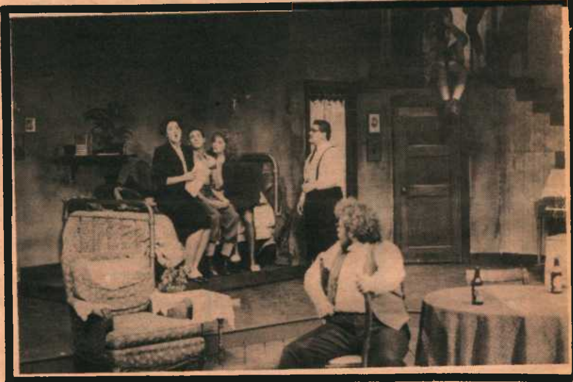
"THE HOSTAGE" is currently playing at the creative arts theater.

It is often difficult for educational theatre to properly select the shows which are best suited to its talent and facilities. Perhaps "The Hostage", played elsewhere, would have fared better than it did in this department. In smaller educational theatre some shows play better than others and some don't play at all. In regard to "The Hostage" this may very well have been the case. A look at future shows will perhaps shed a clearer light on the situation.