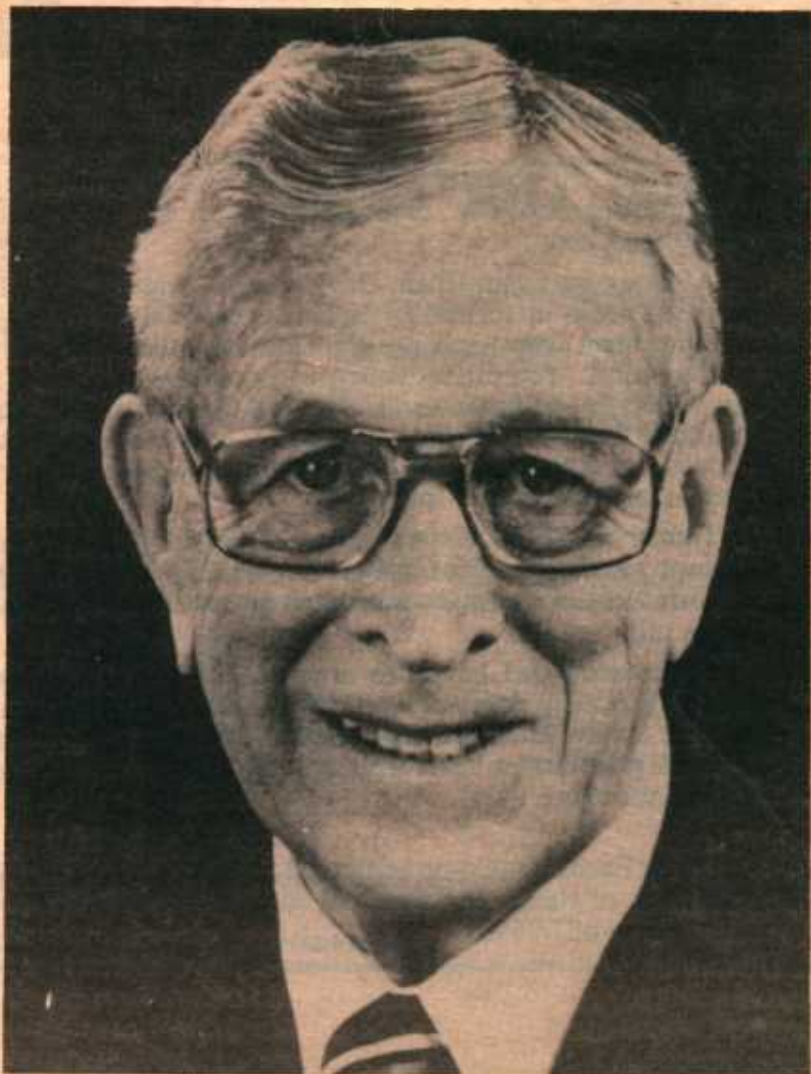
Former UCLA Coach John Wooden

The forum will be held Thursday, January 14, from 1 to 3 in the SUMP located in the Student Union. All students, faculty, staff and administrators are encouraged to attend.