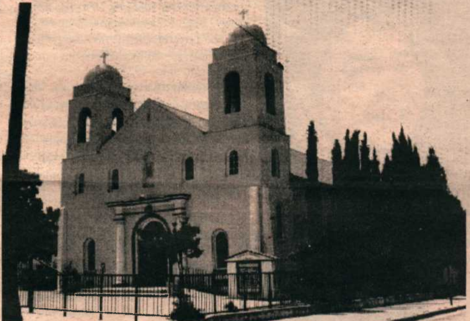
Our Lady of Guadalupe Shrine on the corner of Ninth and Park, Riverside, which was built in 1929.

The date was December 8, 1929 and the entire Eastside community of Riverside was gathered on the corner of Ninth and Park, grandparents, parents, youth of all ages, the girls choir trained by the Carmelite Sisters, a band that traveled all the way from Corona. Everyone was dressed in their Sunday best, and it was a beautiful day. This