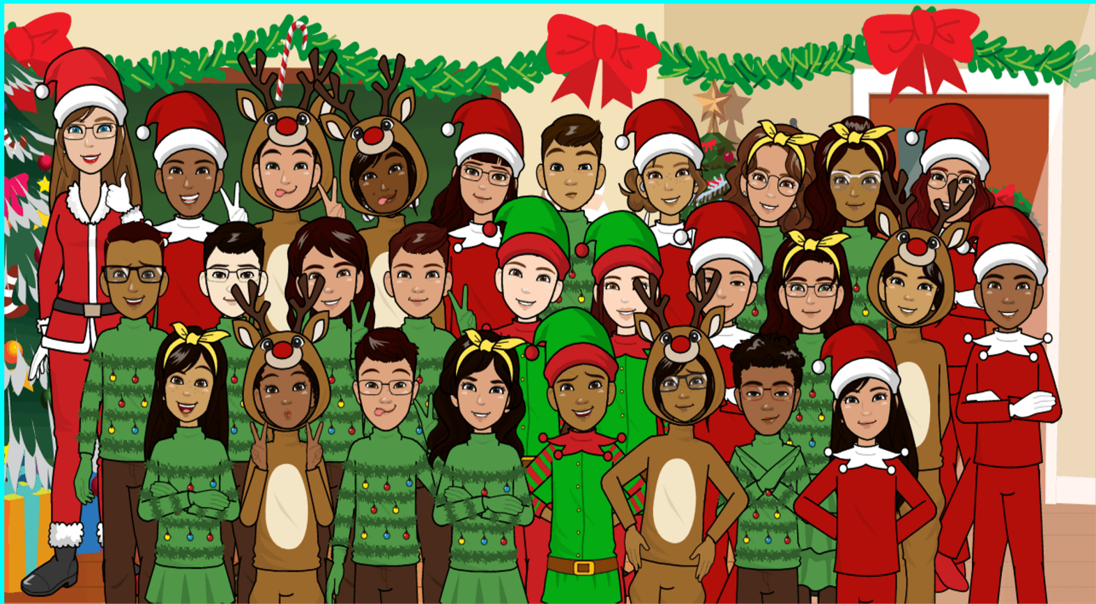
December 2020 Avatar classroom picture