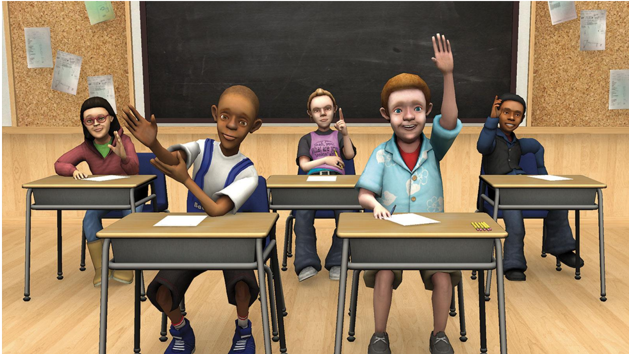
Figure 2 TeachLive Interface