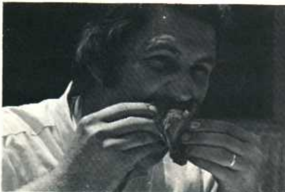
The Art Department's Third Annual Chicken Feed was a Sell-out!

"Now that S.U.F.F.E.R. and A.S.B. are the same thing, maybe we can get something done. I think we finally have some officers who are willing to devote the time, energy, and risk necessary for reform. There are people involved who won't be compromised and who are ready to listen to the gripes of all the students. We want to act on behalf of the whole student population and not just for ourselves or small interest groups. I am happy to be a part of the new government and hope that you will feel free to contact me or any of the other officers when you have anything you want known. I promise you that I will use whatever resources I have to further student rights, and I'm sure the other officers feel the same way."