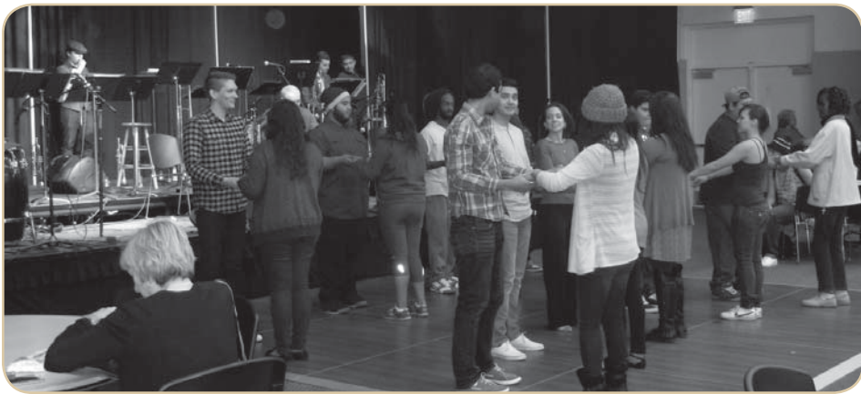
Things heat up at CSUSB with some salsa and Latin jazz where students were able to show off their mad dancing skills.