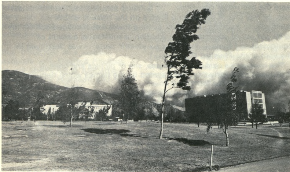
PANORAMA FIRE — About noon smoke from the Nov. 25 fire billowed down the mountain and across campus. Story and other pictures on Pages 2 and 3.

Newsletter of the California State College, San Bernardino Alumni Association — January, 1981