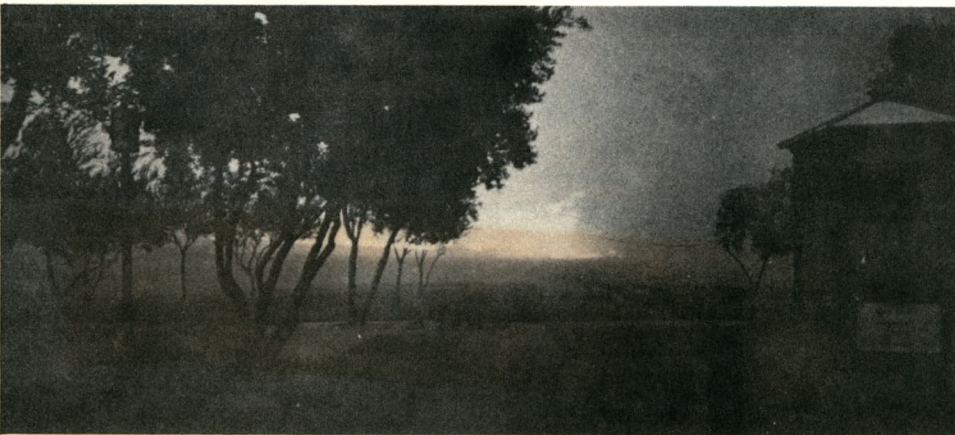
FLAMES ON CAMPUS — By mid-afternoon, flames were licking at the edge of the parking lot behind the Physical Sciences Building.