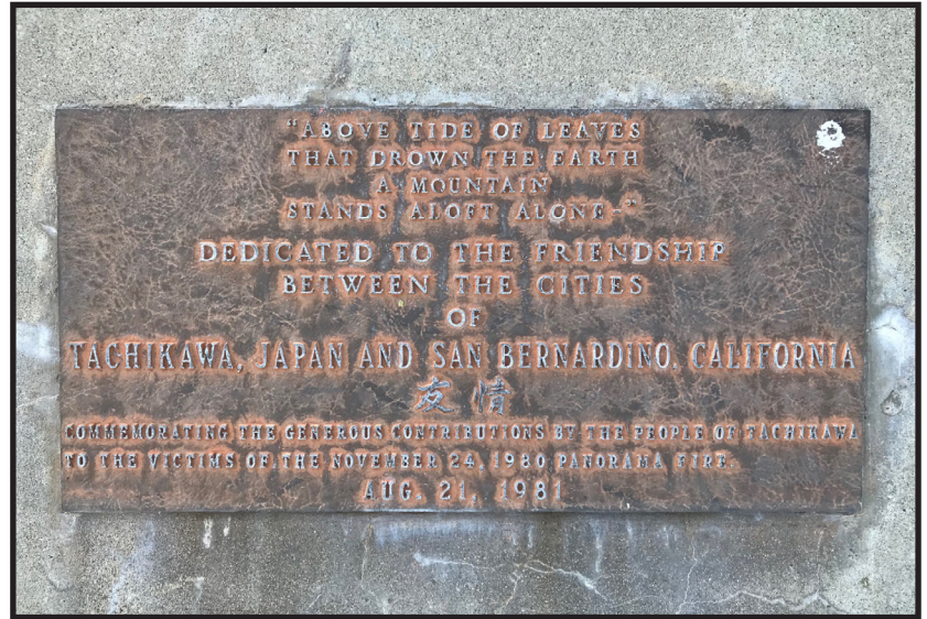
Plaque dedicated to the friendship between cities Located outside Theater Arts Building

The plaque depicted above, then, stands as a symbol for what this relationship has come to signify. When so much of our media dictates an emphasis on the negative side of difference, this sign stands as a positive reminder of what sincere and communicative delegation can do; and, in this turbulent communico-sphere of our day and age, it's comforting to see a physical representation of a program that has proved entirely positive.