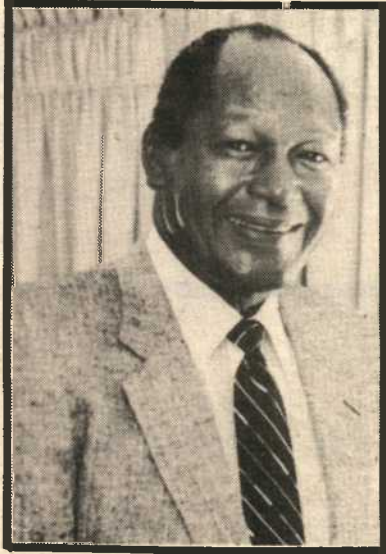
L. A. Mayor Tom Bradley