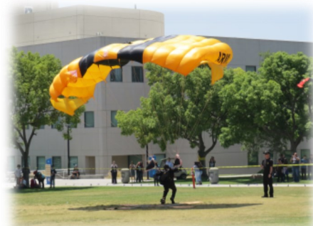
Golden Knight lands on the library lawn