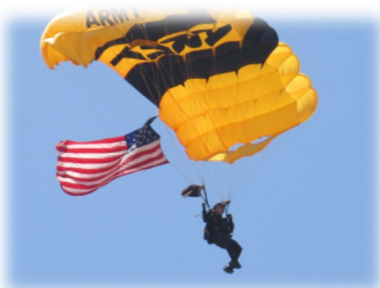
Golden Knight soaring above campus