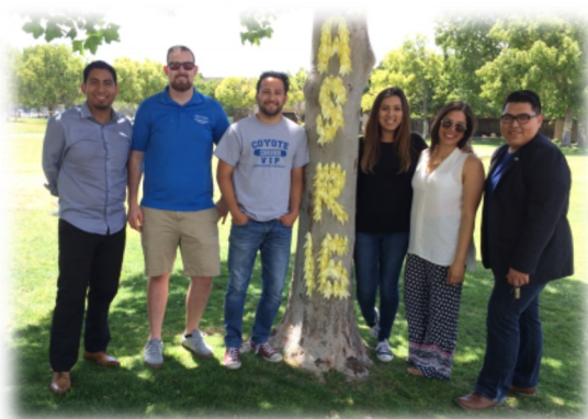
Students pose with their decorated tree

The Veterans Success Center at CSUSB San Bernardino campus hosted the Armed Forces Day-Yellow Ribbon Campaign on May 18. The event was a huge success with diverse programs and showcases demonstrating the high technology levels of all the forces, and the spirit of unity and teamwork among service members. The highlight of the event was the Golden Knights. The Army Parachute Team made excellent landings on the target without a hitch despite the windy conditions. For the Yellow Ribbon Campaign, various campus departments to student organizations and volunteers gathered on the library lawn with the sole wish and hope for safety and the wellness of military members deployed around the globe. The decorated trees brought awareness and appreciation for our fighting forces by reminding us of the importance of national defense and peacekeeping.