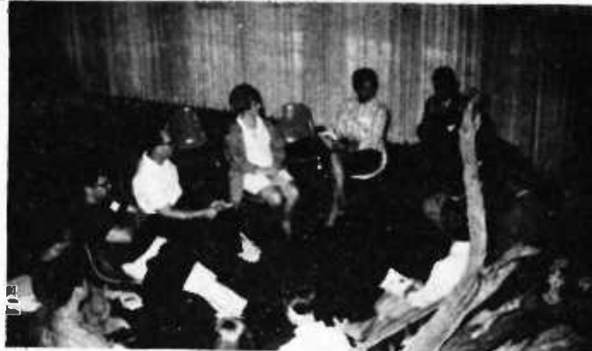
Discussion Groups Proved Helpful at the Monte Corona Orientation