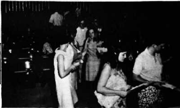
"The Bridge on the River Kwai" TONIGHT at 7:30 p. m. PS Lecture Hall