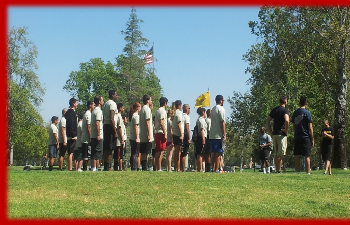
Future soldiers form up for PT