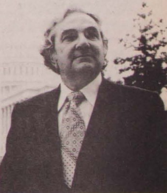
Congressman George Brown

The Opportunities Industrialization Center grows from a pilot project in Philadelphia to some 110 centers in 43 states and has spread to six foreign countries. It has trained and placed in jobs more than 200,000 persons. OIC graduates have a job retention rate of about 85%. According to a recent article about OIC, it was estimated that their job training programs cost only a third as much as most government manpower programs.