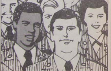
THE ARMY RESERVE PART OF WHAT YOU EARN IS PRIDE.

A PART-TIME JOB WITH FRINGE BENEFITS. The Army Reserve offers more benefits than some full-time jobs. From regular promotions and raises to retirement pay. Call your local unit. It's listed in the white pages of the phone book under "U.S. Government".