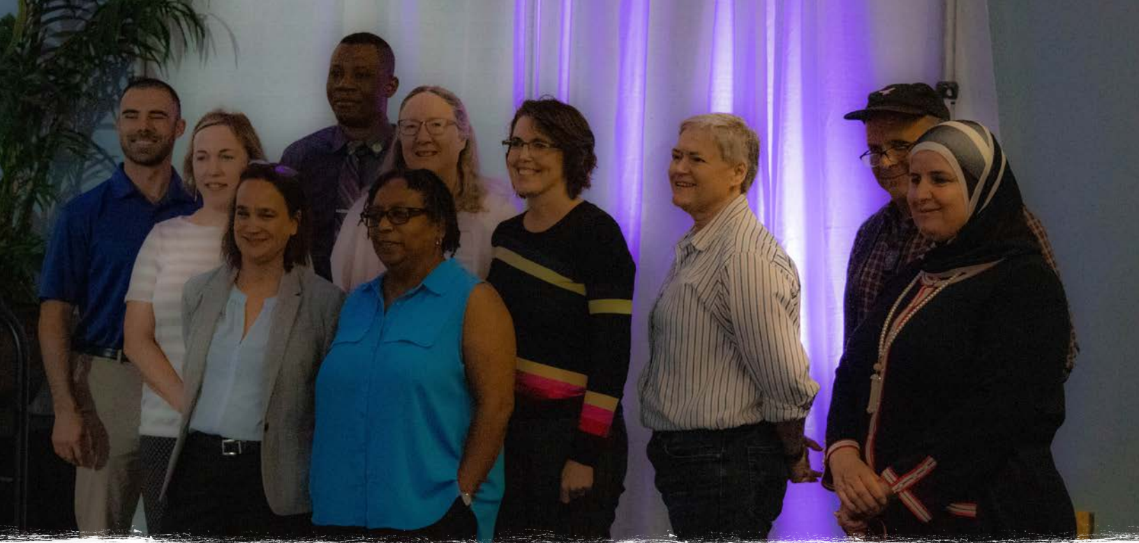
Faculty that served as committee chairs on theses, projects, and dissertations were recognized at the Graduate Education Week brunch.