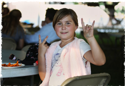
A future Coyote gets ready to join the pack.