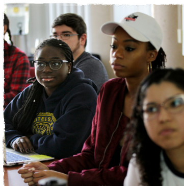
One of the many workshops held during Graduate Education Week.

We hope you had the opportunity to participate in one (or all!) of our Graduate Education Week events, and look forward to doing it again next year!