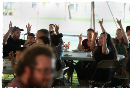
Grad students and their families had a howling good time!