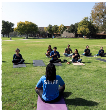
Yoga on the lawn.

That same afternoon, we invited the campus community to our Graduate Studies Open House , where guests were treated to hot chocolate and cookies in our courtyard. We gave away two gift baskets, shared information on our outstanding graduate programs, and had a great time encouraging future coyotes to join the pack!