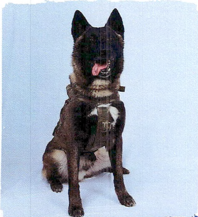
Military Working Dog Conan