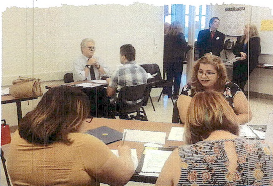
Recruiters Conducting Mock Interviews with Students

WA-IV collaborated with the Department of Rehabilitation (DOR) Inland Empire District, Palm Desert Branch, and College of the Desert's WorkAbility III program to host a Job Placement Circle for students with disabilities on October 24, 2019 at the Palm Desert Campus. Students interviewed with nine HR recruiters from Coachella Valley Lighthouse, Cathedral City, DesertArc, Robert Half, Desert Best Friend's Closet Coachella Valley, California Department of Rehabilitation, and Stars Behavioral Health Group. WA-IV students dressed to impress and came highly prepared as most participated in a mock interview in advance of the event. Students were informed about how to apply for specific jobs, which matched their major. Thirteen students attended and CSUSB students participated in over 30 interviews.