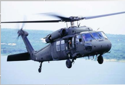
UH-60 Black Hawk Helicopter