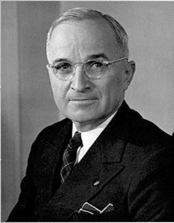
President Harry S. Truman